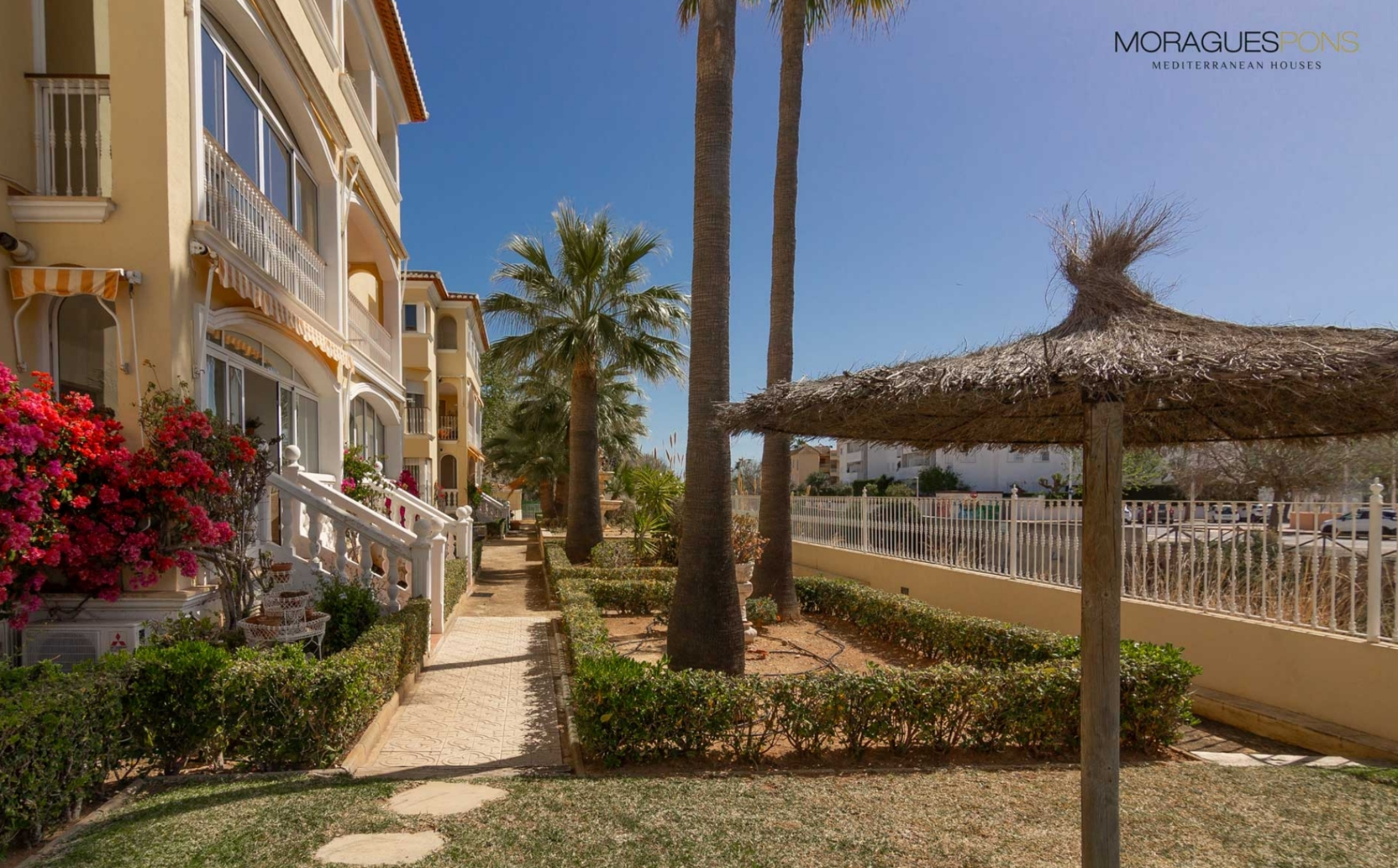
Newly refurbished ground floor apartment in the Port of Jávea at 450m from the Grava beach. PORT, JÁVEA/XÀBIA - REF. A-405