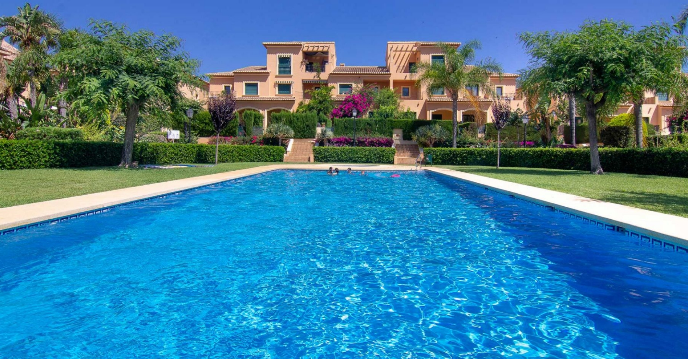
One bedroom flat in the port of Jávea PORT, JÁVEA/XÀBIA - REF. A-342