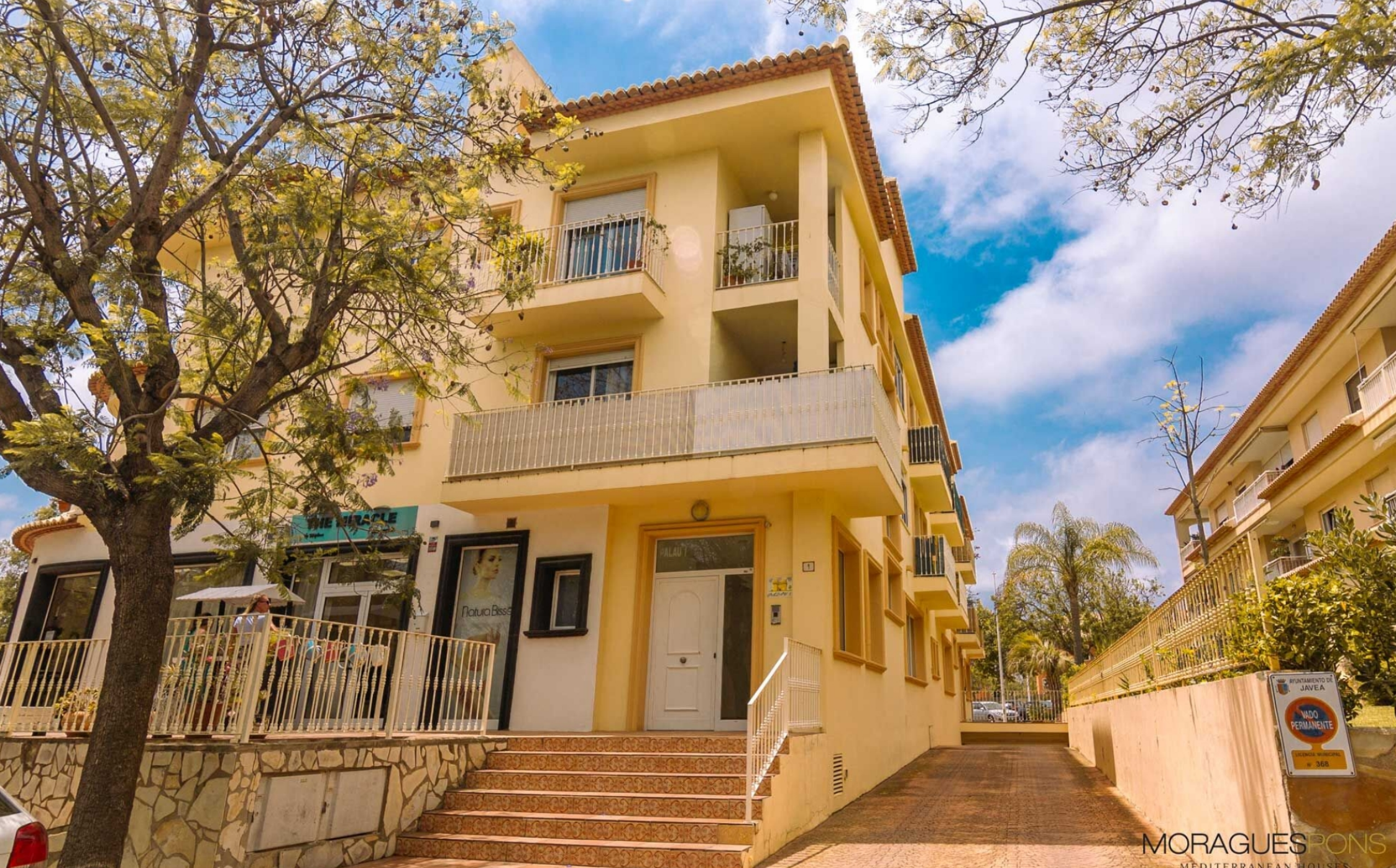
Parking place + storage for sale in the port area of Jávea JÁVEA/XÀBIA - REF. P-1606