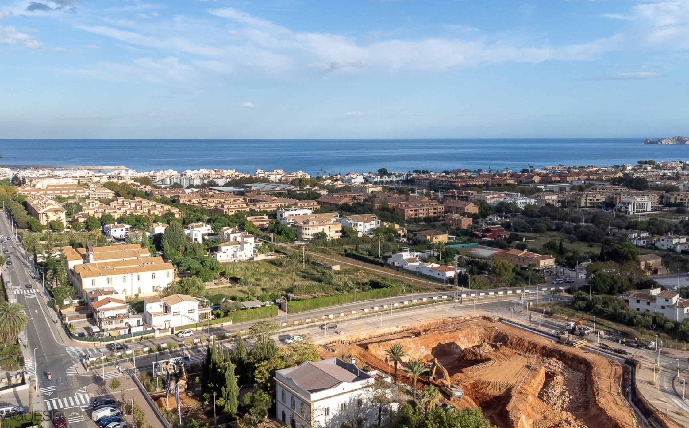
Plot for sale for construction of 24 flats in Jávea OLD TOWN CENTER, JÁVEA/XÀBIA - REF. S-005