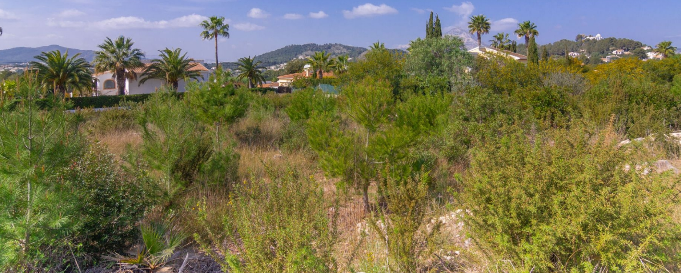
Plot in Pinosol - Jávea JÁVEA/XÀBIA - REF. S-067