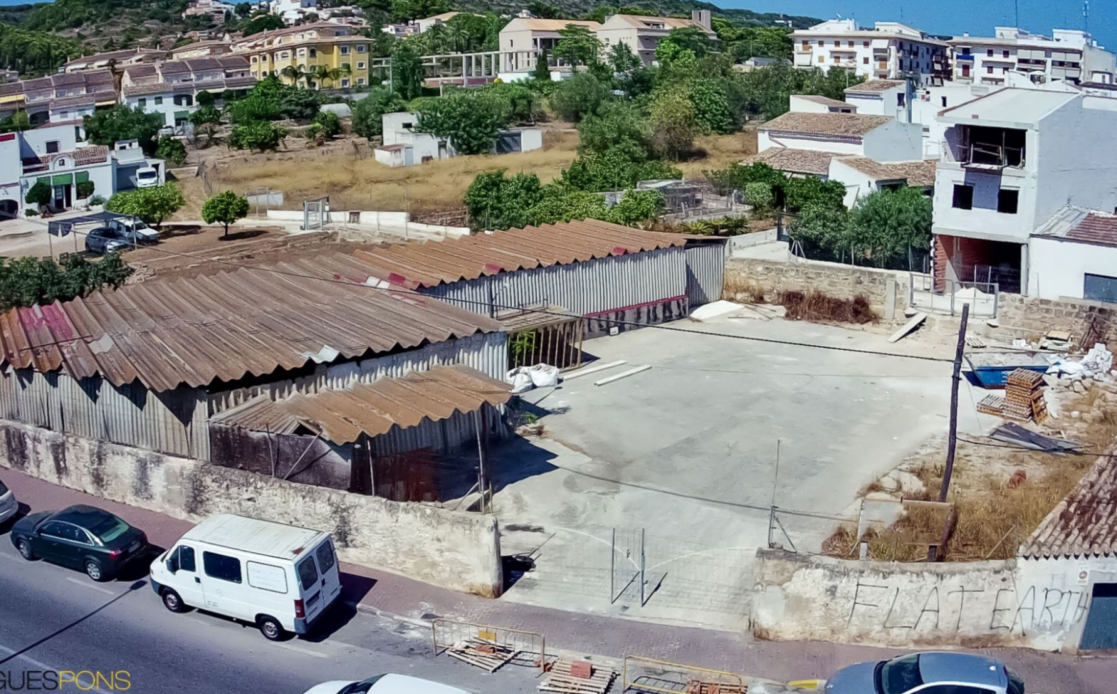
Plot to build flats in Jávea OLD TOWN CENTER, JÁVEA/XÀBIA - REF. S-057