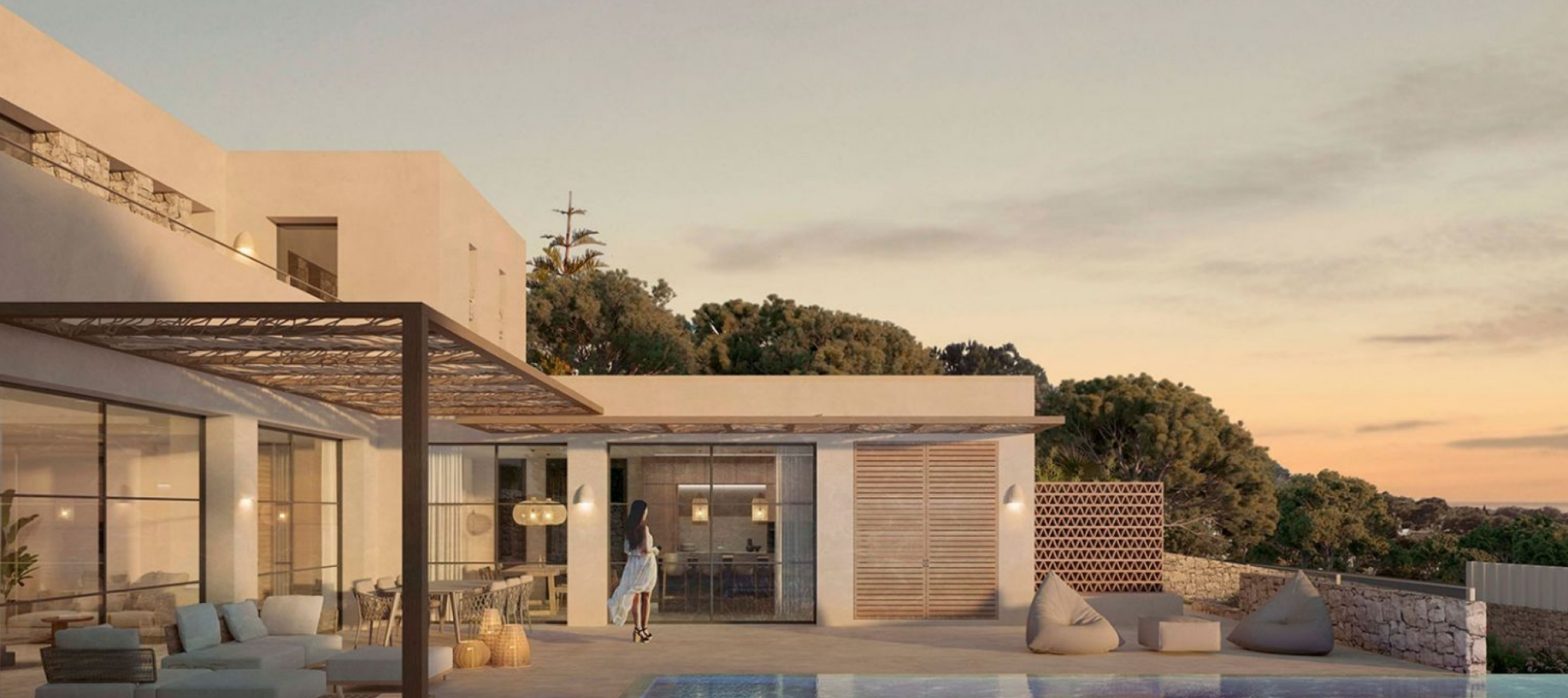
Plot with project and excavation started in Jávea. BALCÓN AL MAR - PORTICHOL, JÁVEA/XÀBIA - REF. S-049