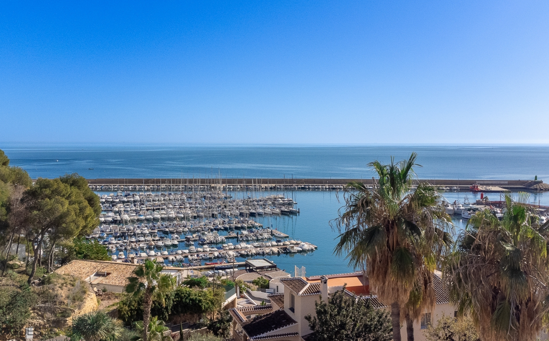
Plot with sea views in La Cuesta de San Antonio in Jávea CUESTA SAN ANTONIO - PUCHOL, JÁVEA/XÀBIA - REF. S-105