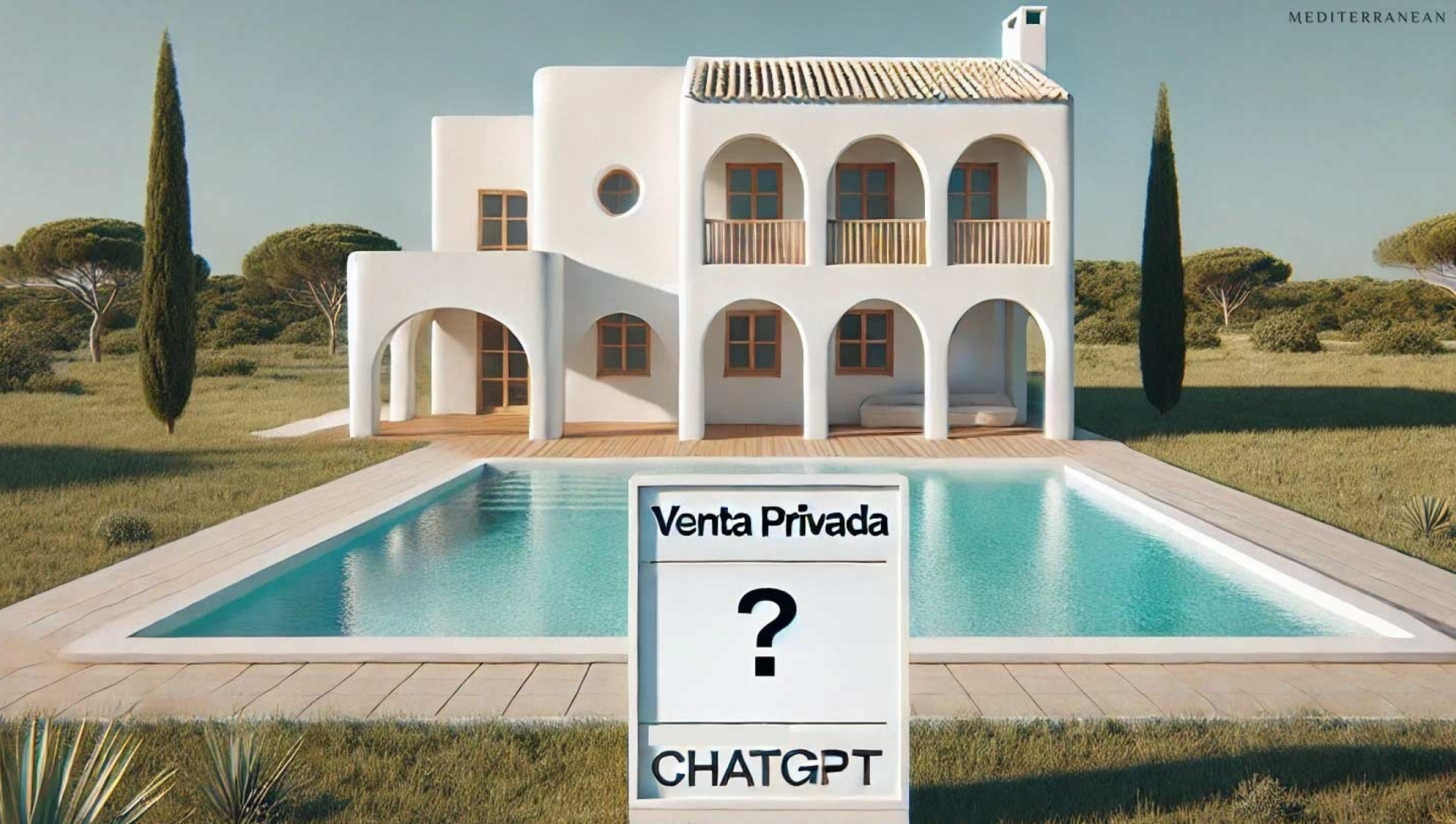
IMAGEN NO CORRESPONDE CON LA CASA / THIS IMAGE DOES NOT CORRESPOND WITH THE ACTUAL HOUSE

Private sale of a villa in Jávea CAP MARTÍ - PINOMAR, JÁVEA/XÀBIA - REF. VP06