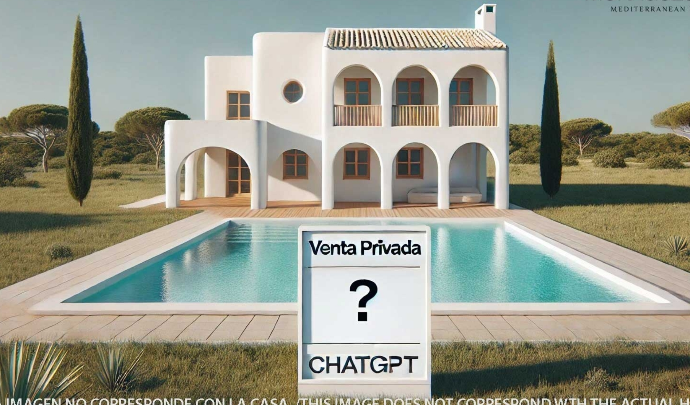
IMAGEN NO CORRESPONDE CON LA CASA / THIS IMAGE DOES NOT CORRESPOND WITH THE ACTUAL HOUSE