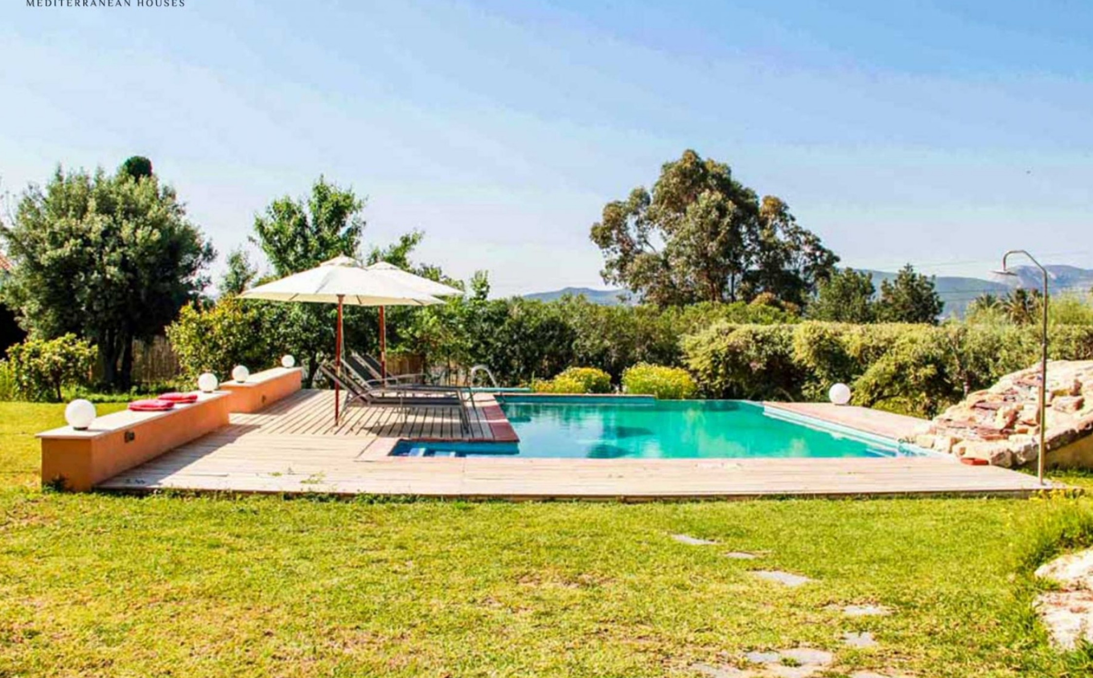
Rural property in Jávea

MONTGÓ - PARTIDA TOSAL, JÁVEA/XÀBIA - REF. V-143