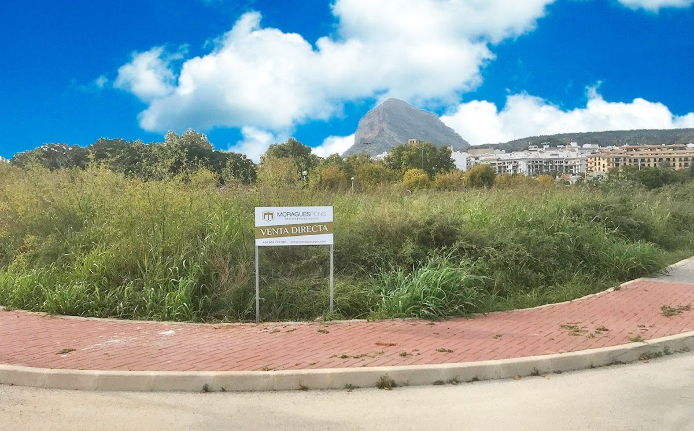
Sale plot urbanized in Jávea OLD TOWN CENTER, JÁVEA/XÀBIA - REF. S-003