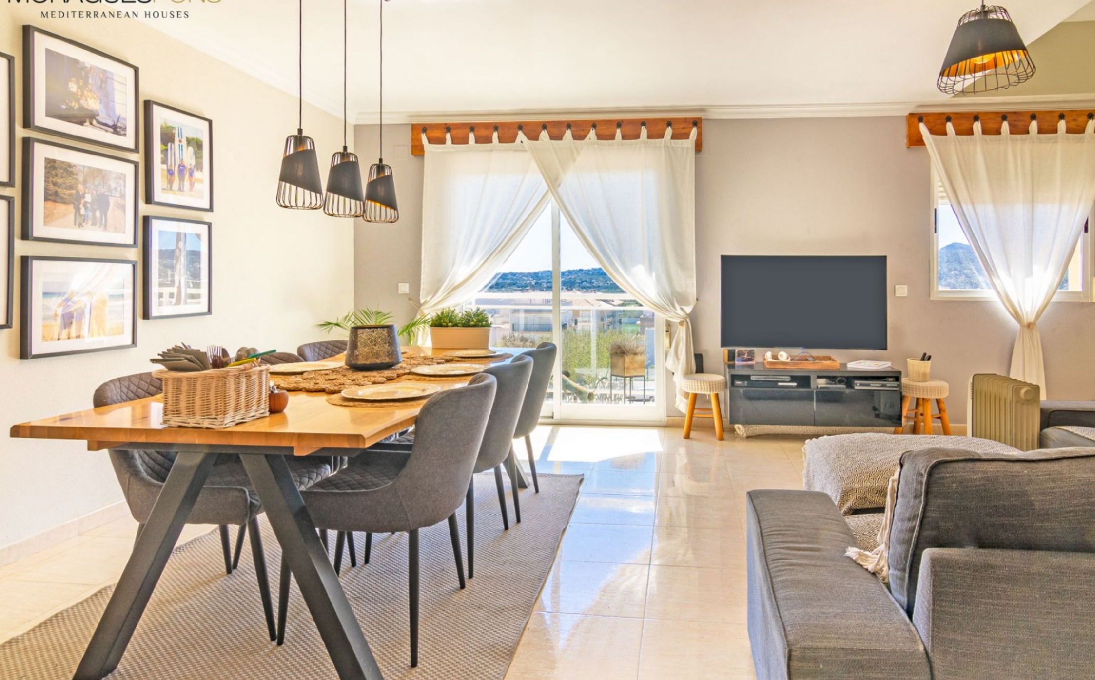
South facing penthouse for sale with sea views OLD TOWN CENTER, JÁVEA/XÀBIA - REF. A-322