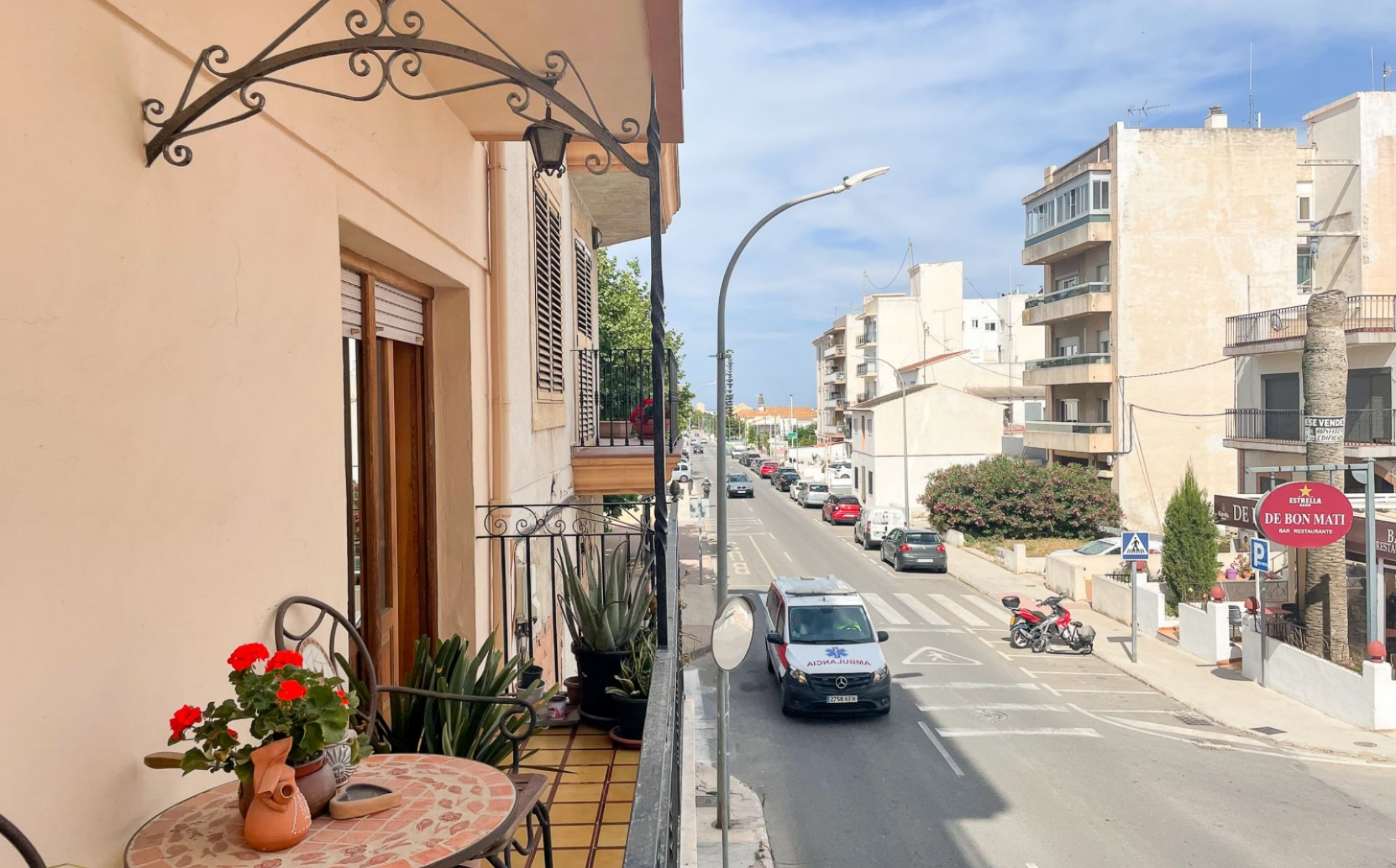
Three-bedroom flat with lift in Jávea centre OLD TOWN CENTER, JÁVEA/XÀBIA - REF. A-345