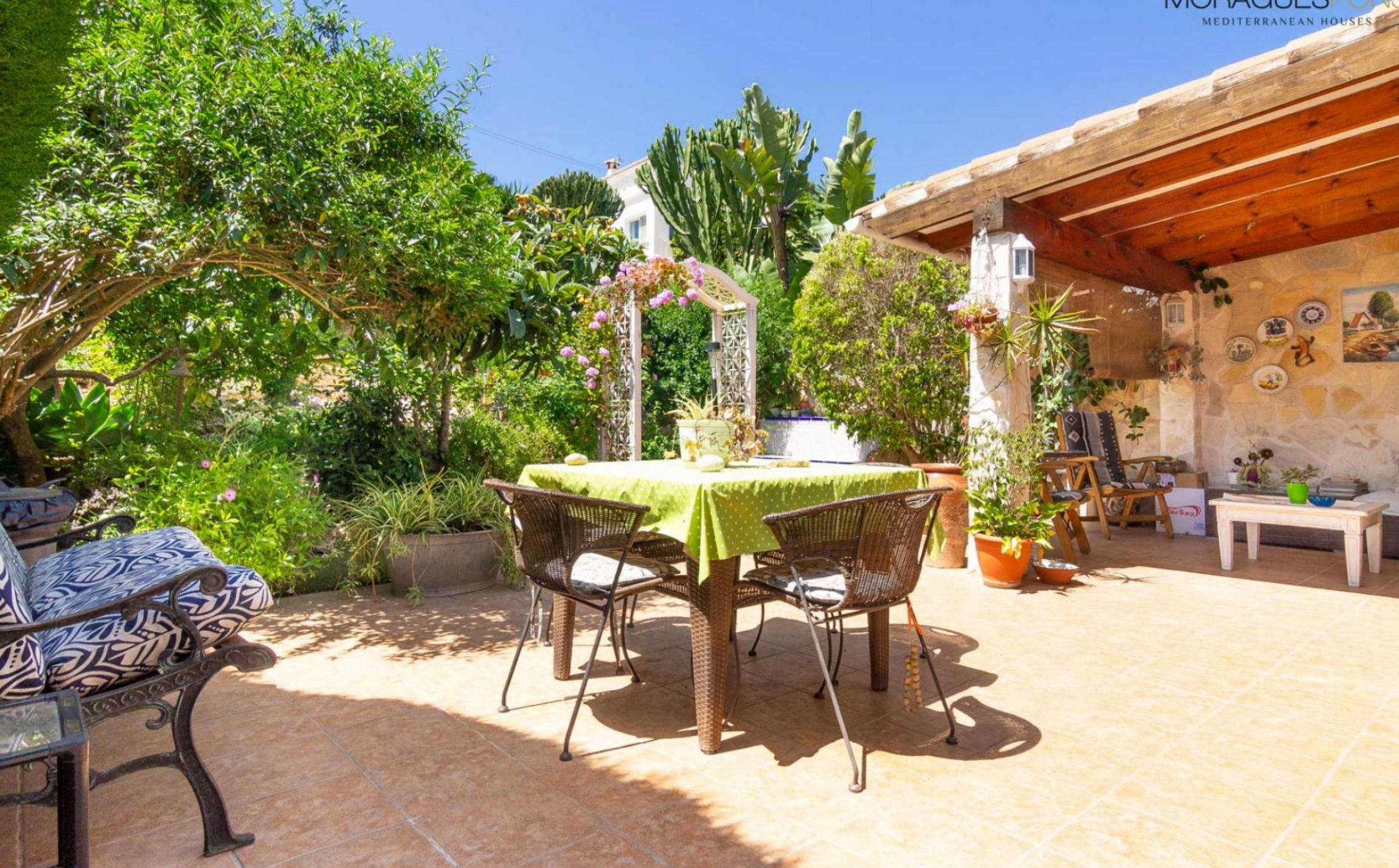
Townhouse in Moraira , close to Portet beach