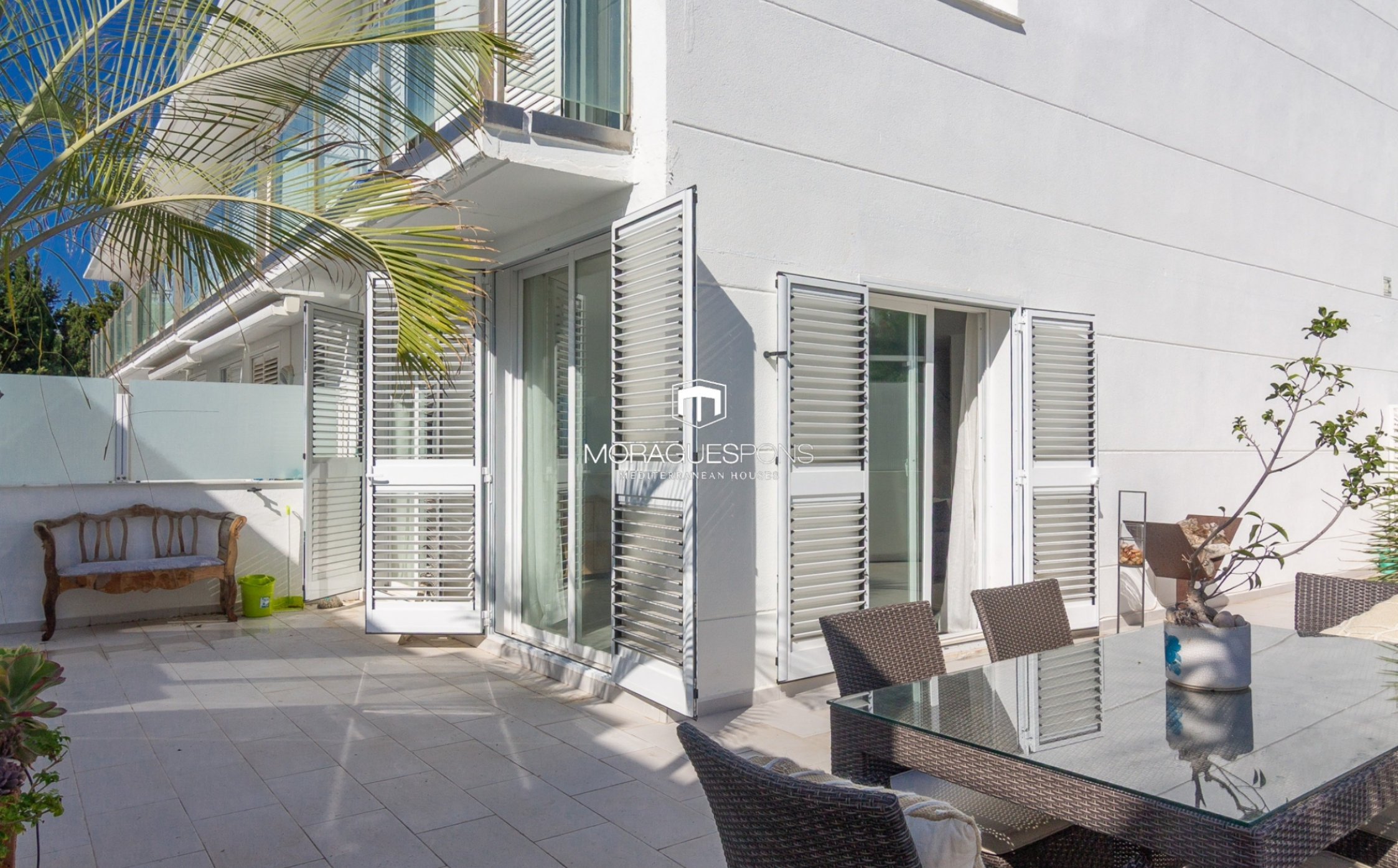
Townhouse in the port of Jávea PORT, JÁVEA/XÀBIA - REF. V-1499