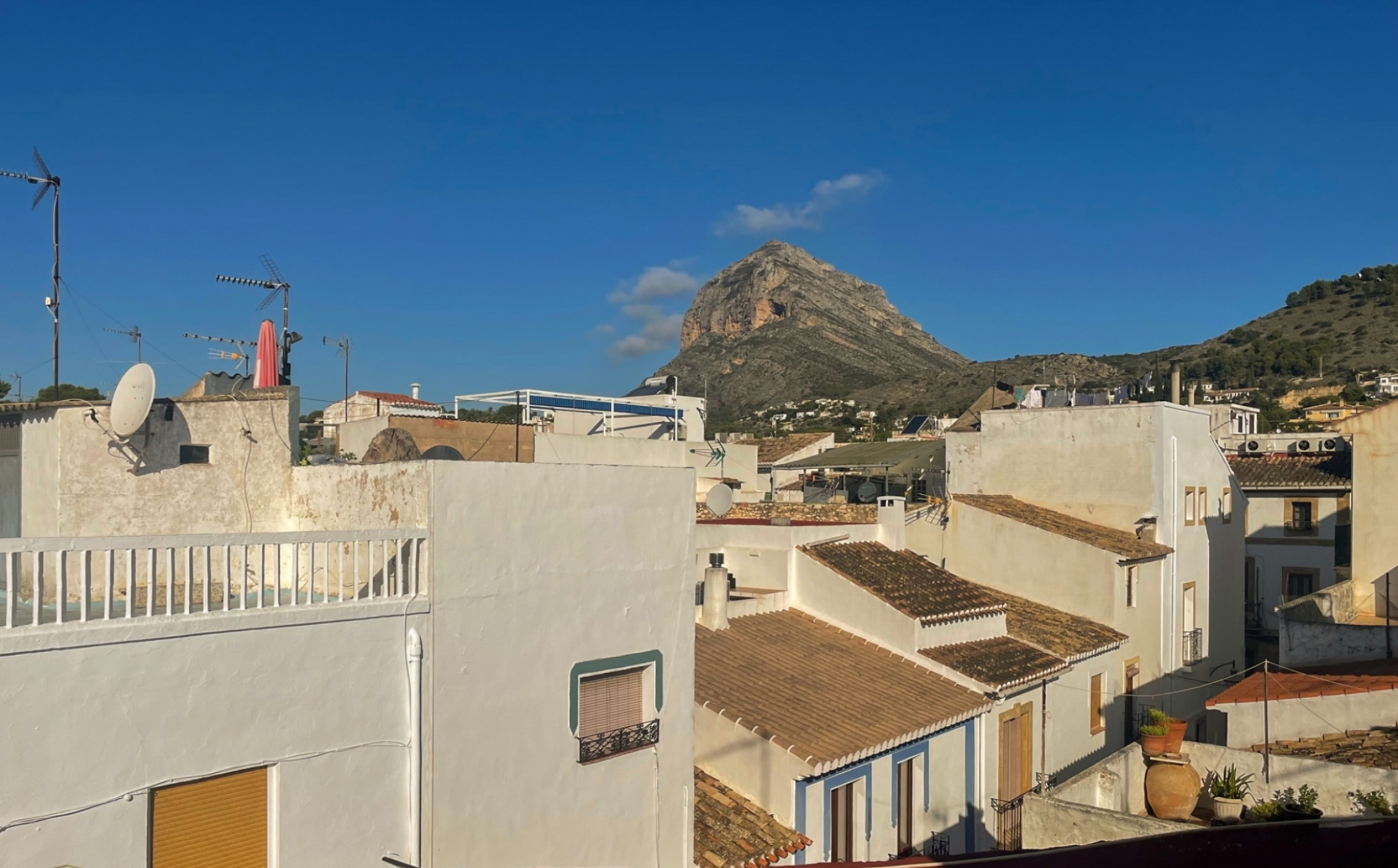
Townhouse to renovate in Jávea OLD TOWN CENTER, JÁVEA/XÀBIA - REF. V-310