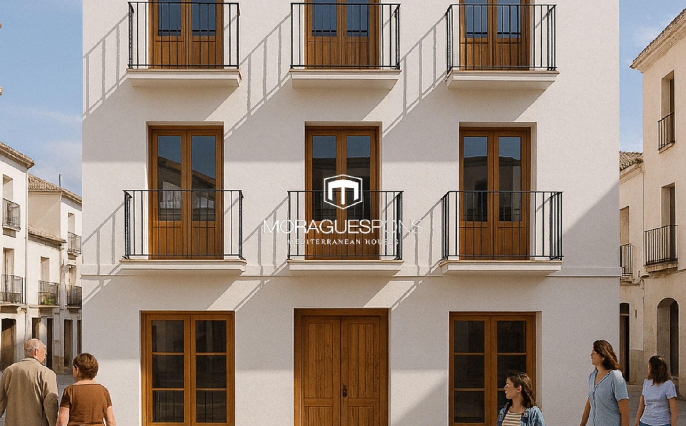
Typical two-story town house and commercial premises in Javea OLD TOWN CENTER, JÁVEA/XÀBIA - REF. VP08