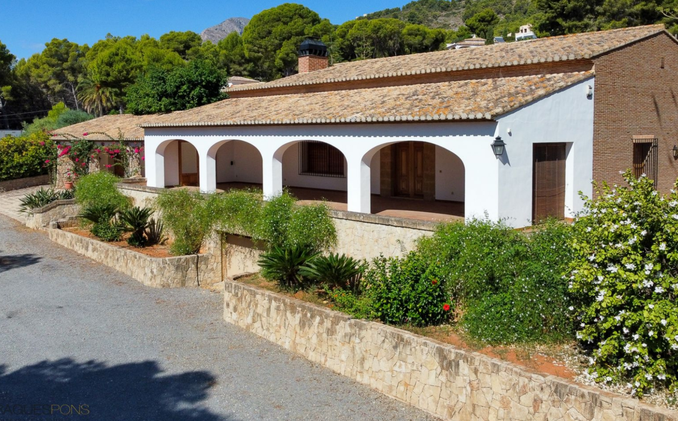
Unique Finca in the port of Jávea PORT, JÁVEA/XÀBIA - REF. V-419