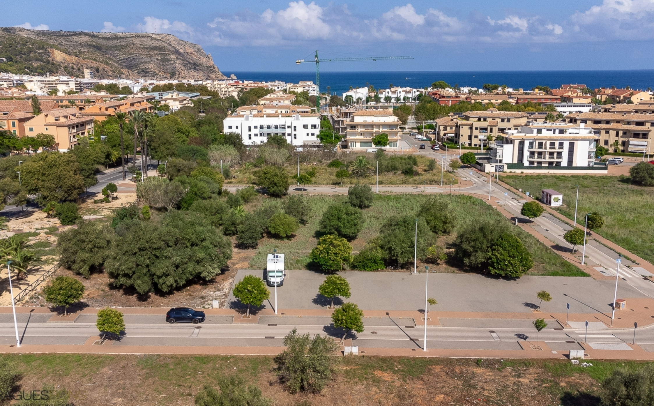
Urban plot of land for tertiary use next to the port of Jávea PORT, JÁVEA/XÀBIA - REF. S-070