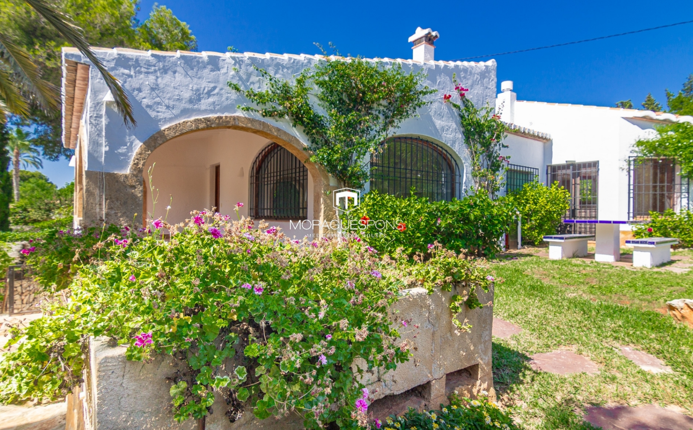
Villa for Sale in El Tosalet, Jávea CAP MARTÍ - PINOMAR, JÁVEA/XÀBIA - REF. V-1420