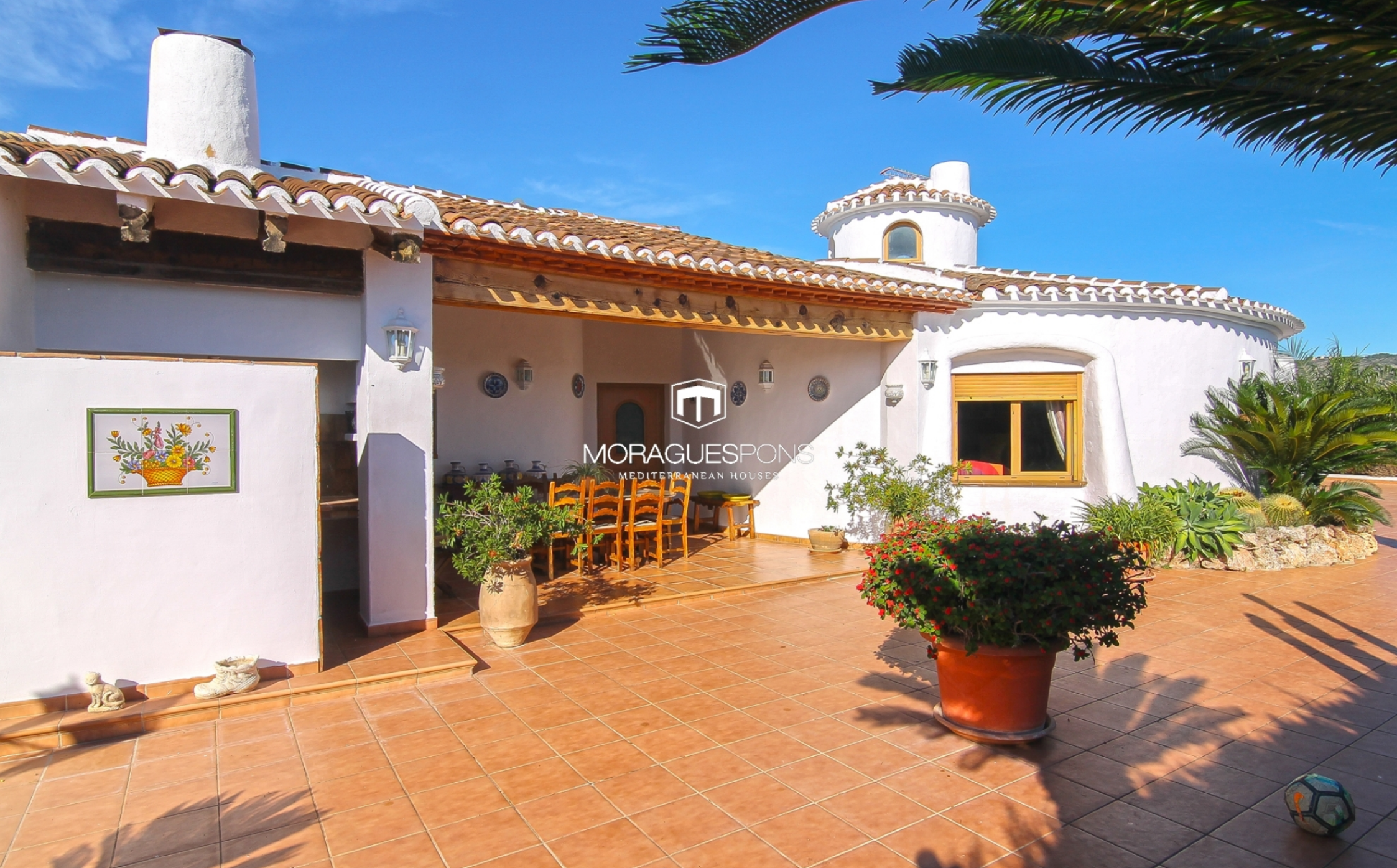
Villa for sale near the beach of Arenal MONTAÑAR - EL ARENAL, JÁVEA/XÀBIA - REF. V-071