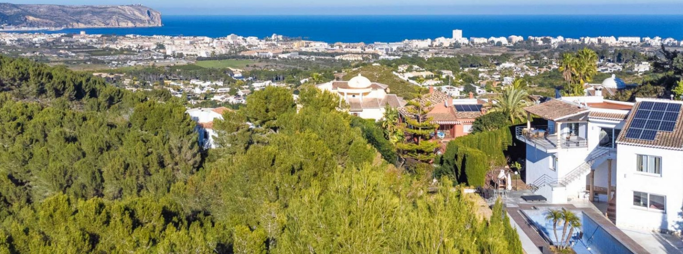
Villa in Adsubia with sea views

PARTIDA COMUNES - ADSUBIA, JÁVEA/XÀBIA - REF. V-467