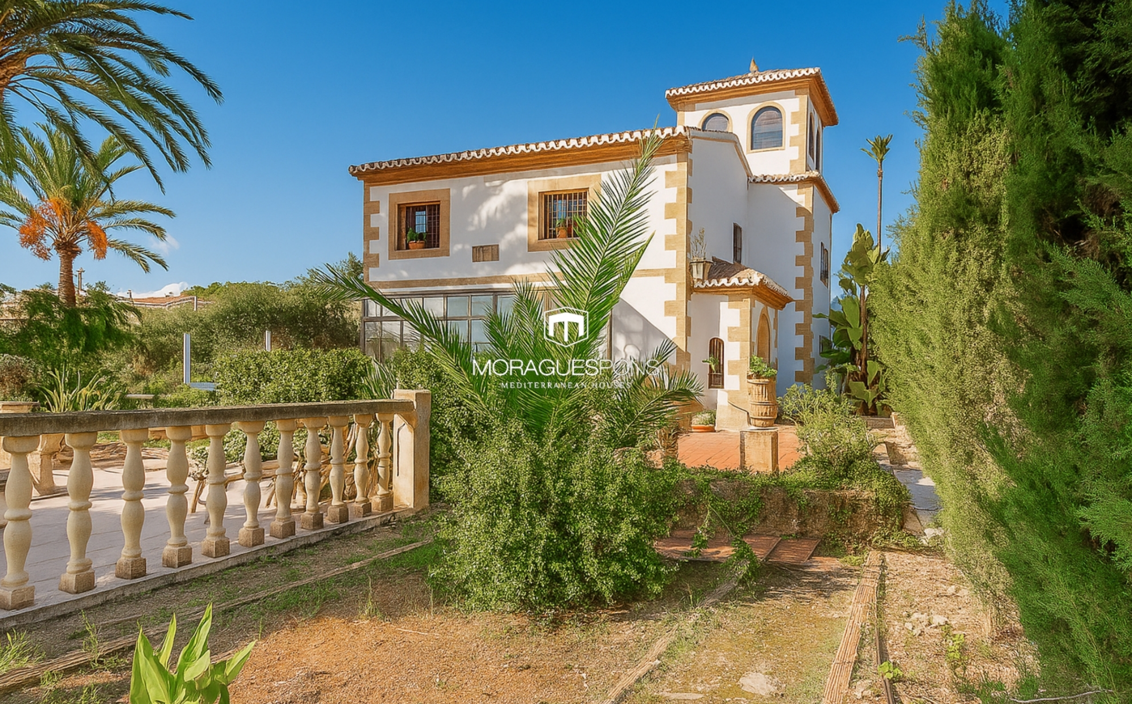
Villa in the Old Town, Jávea OLD TOWN CENTER, JÁVEA/XÀBIA - REF. V-1498