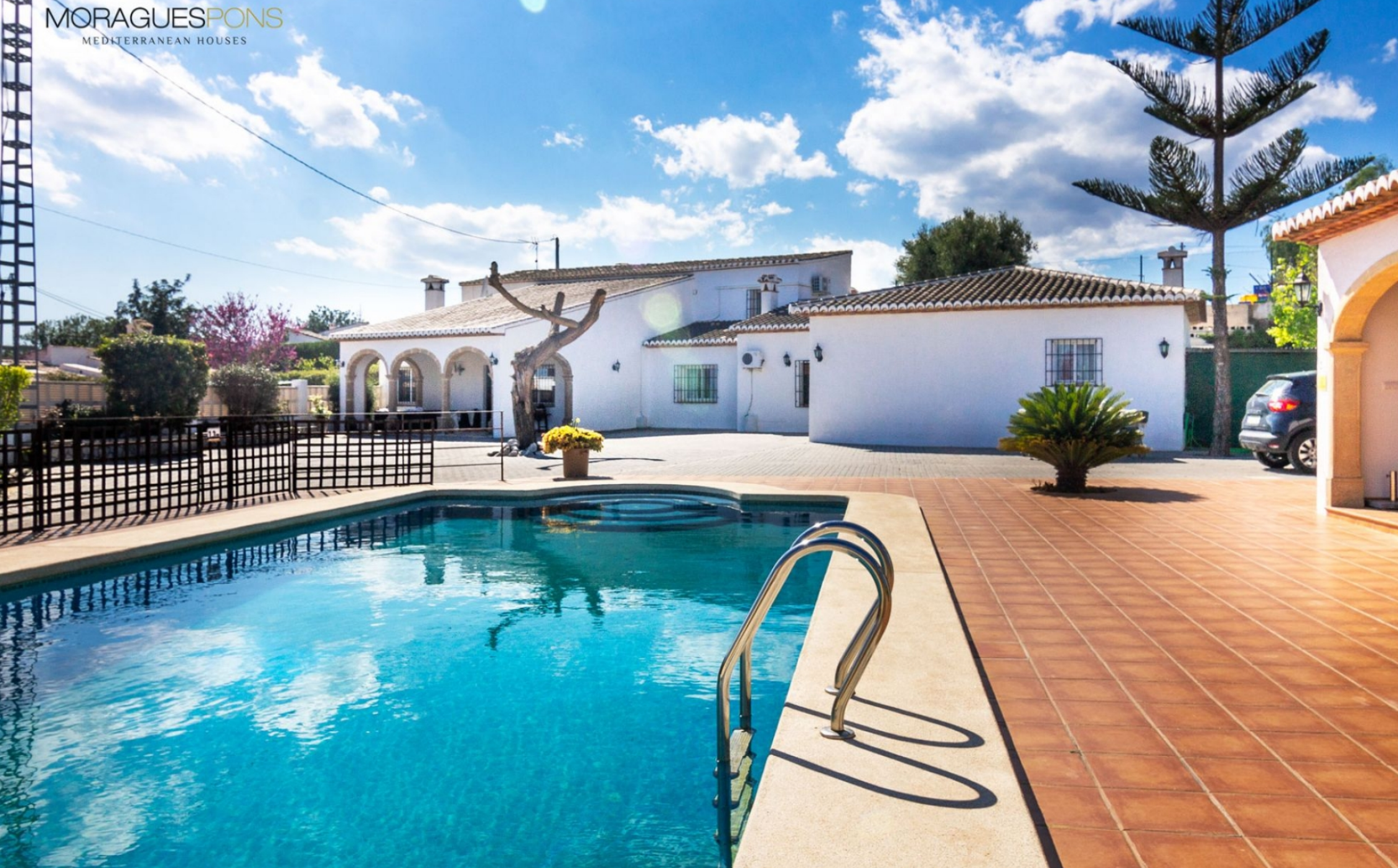
Villa in the town of Jávea OLD TOWN CENTER, JÁVEA/XÀBIA - REF. V-393