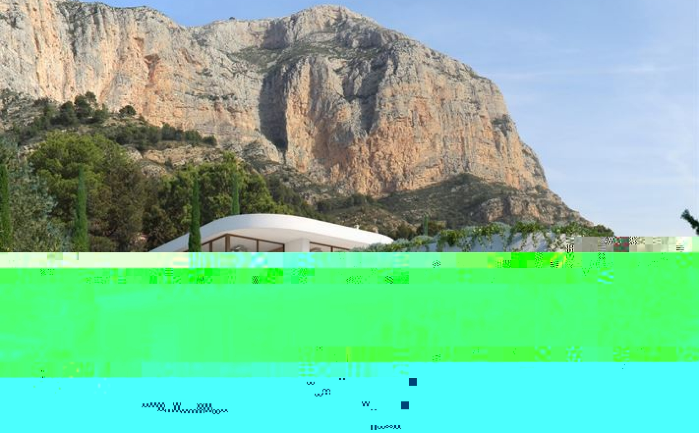
Villa Lavanda, new project in Montgó Nature. MONTGÓ - PARTIDA TOSAL, JÁVEA/XÀBIA - REF. V-203