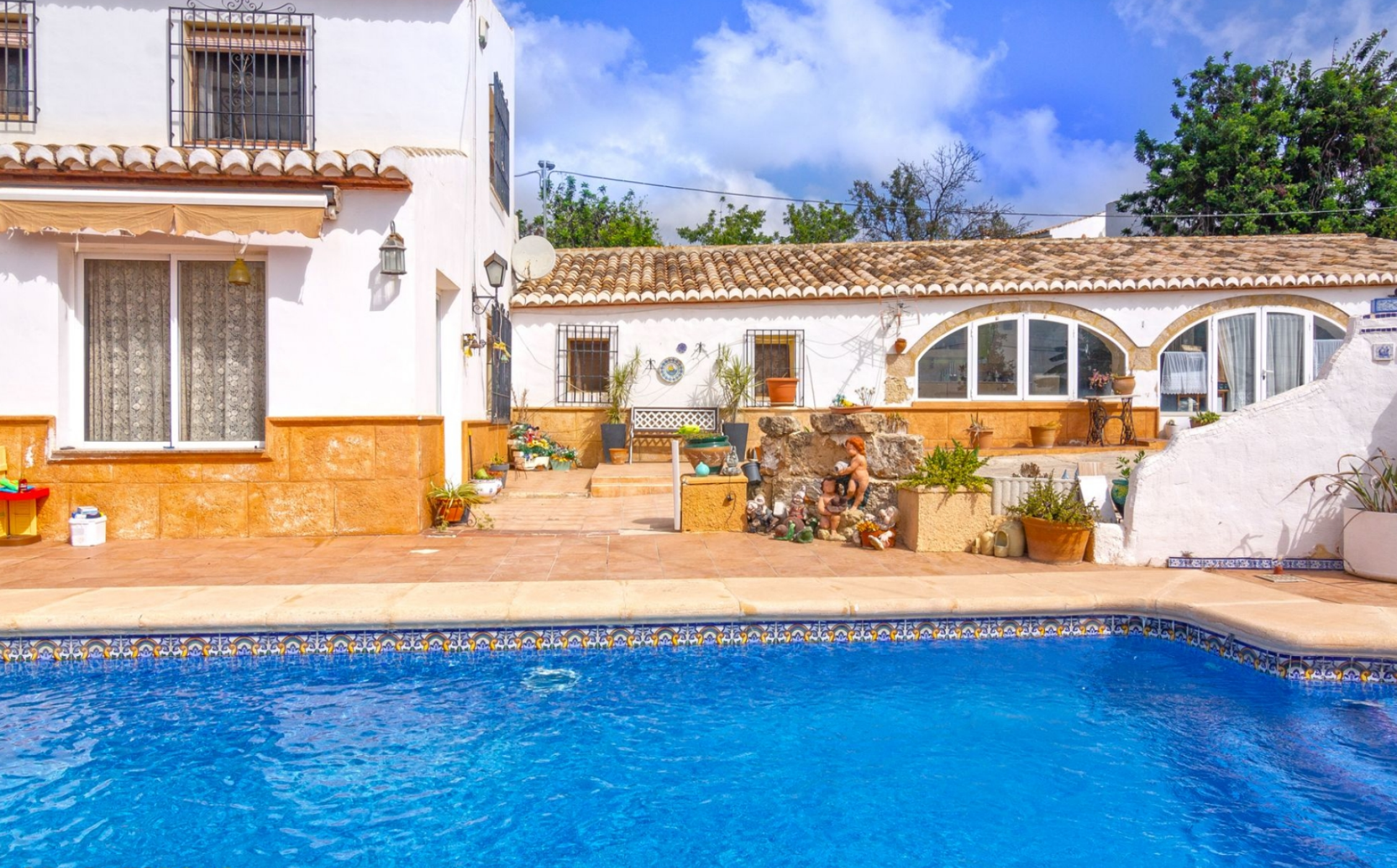
Villa next to the town of Jávea OLD TOWN CENTER, JÁVEA/XÀBIA - REF. V-319