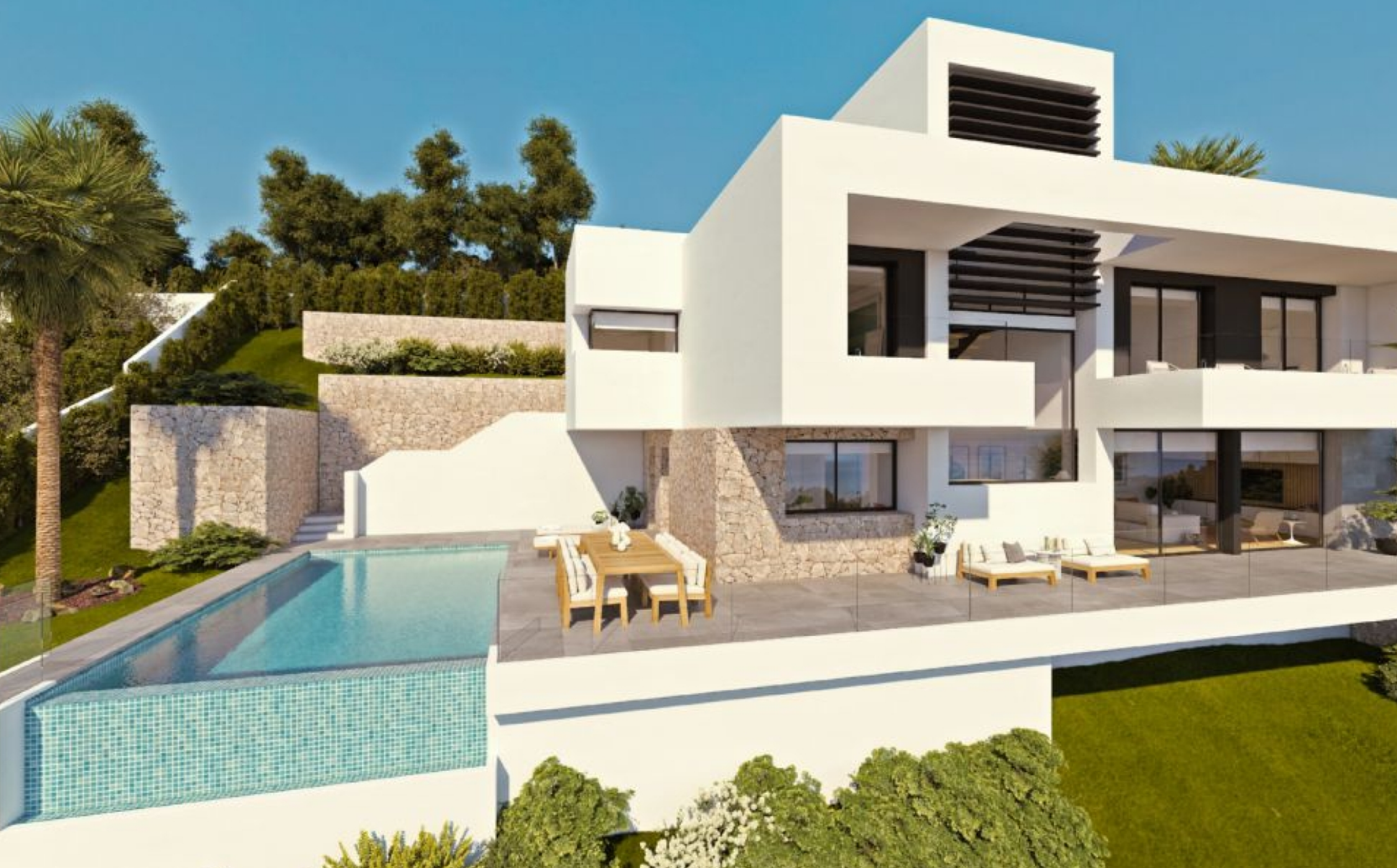
Villa Plenum in the exclusive urbanisation Azure Altea Homes