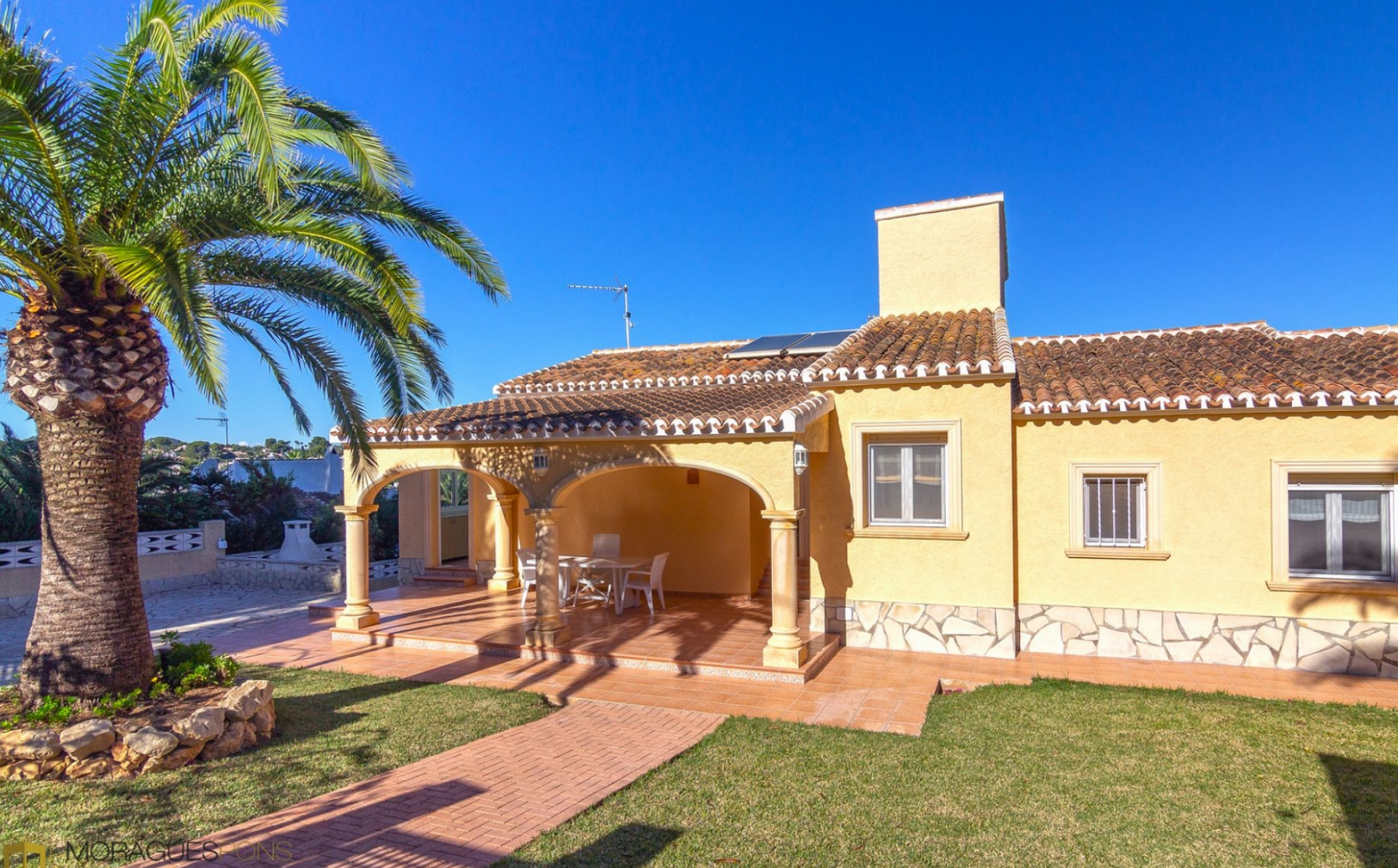
Villa with swimming pool for sale in Jávea CAP MARTÍ - PINOMAR, JÁVEA/XÀBIA - REF. V-464