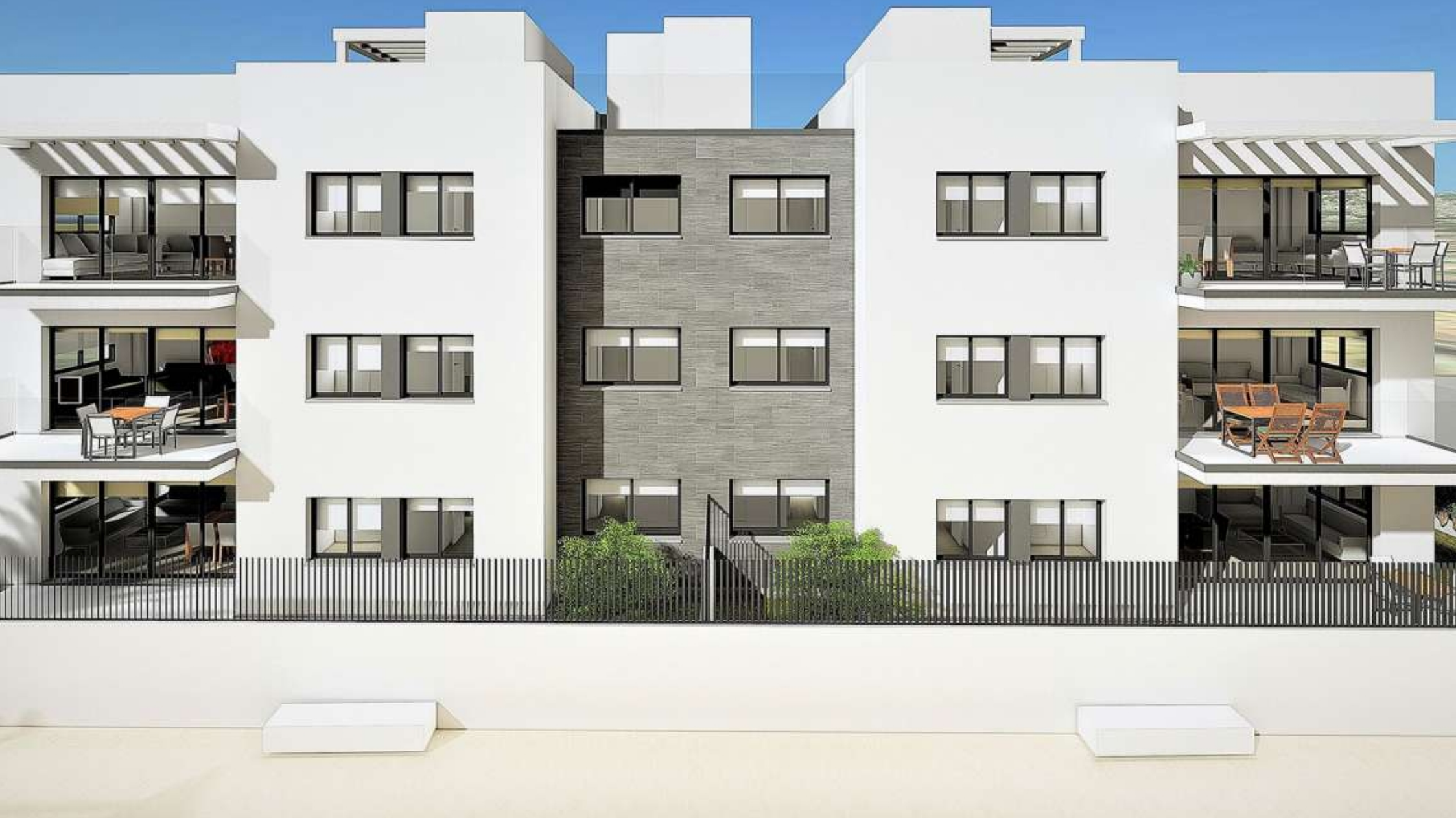
Ground floor with terrace for sale in Residencial Tennis in Jávea MONTAÑAR - EL ARENAL, JÁVEA/XÀBIA - REF. B0D