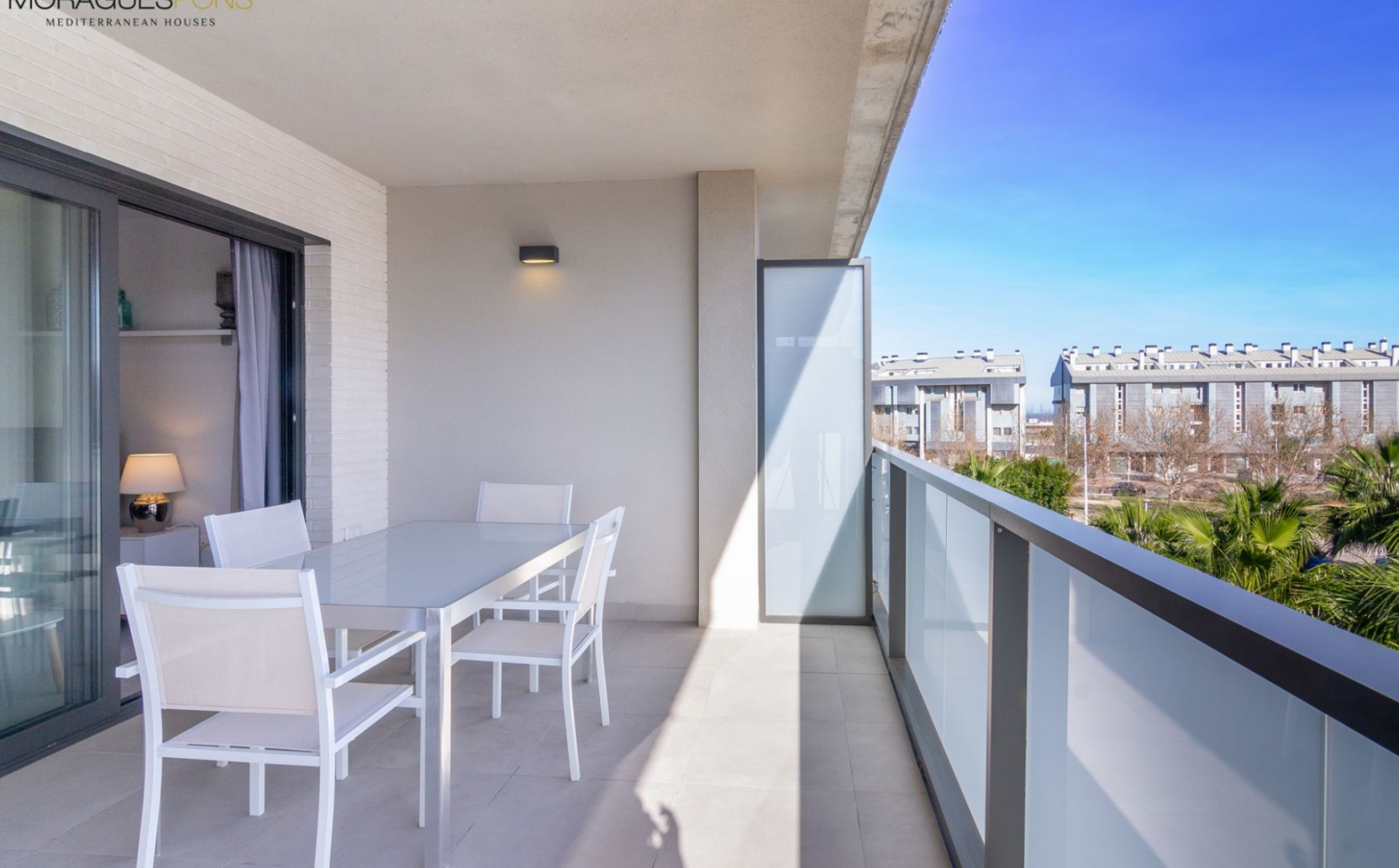
2 bedroom flat for rent on the Arenal beach of Jávea MONTAÑAR - EL ARENAL, JÁVEA/XÀBIA - REF. A-678