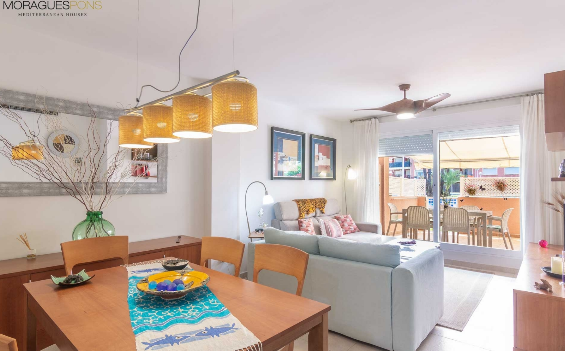
2 bedroom ground floor apartment in Arenal for seasonal rental from September '24 to June '25 MONTAÑAR - EL ARENAL, JÁVEA/XÀBIA - REF. A-692