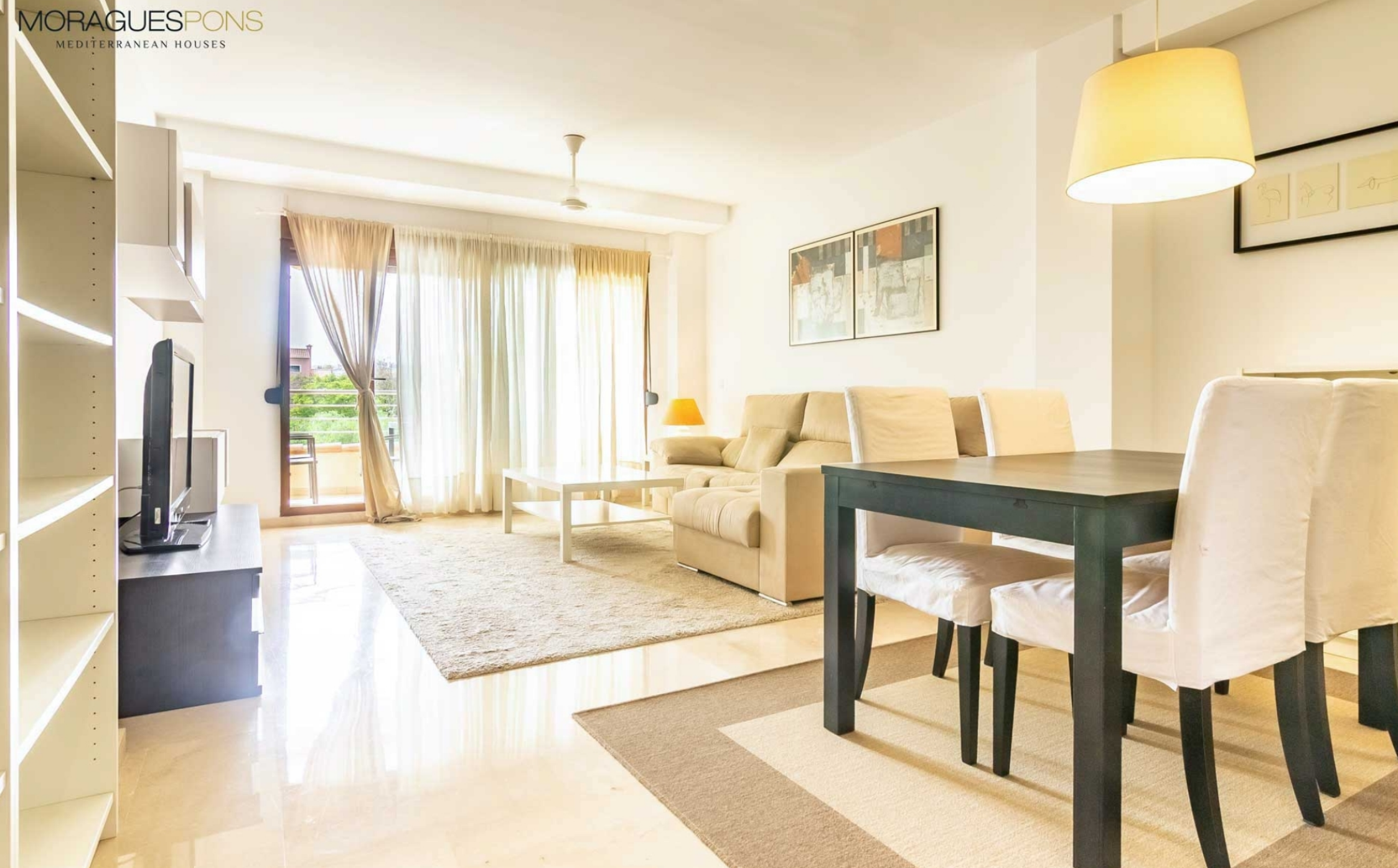
Apartment for 11 months rental in the port of Jávea PORT, JÁVEA/XÀBIA - REF. A-667