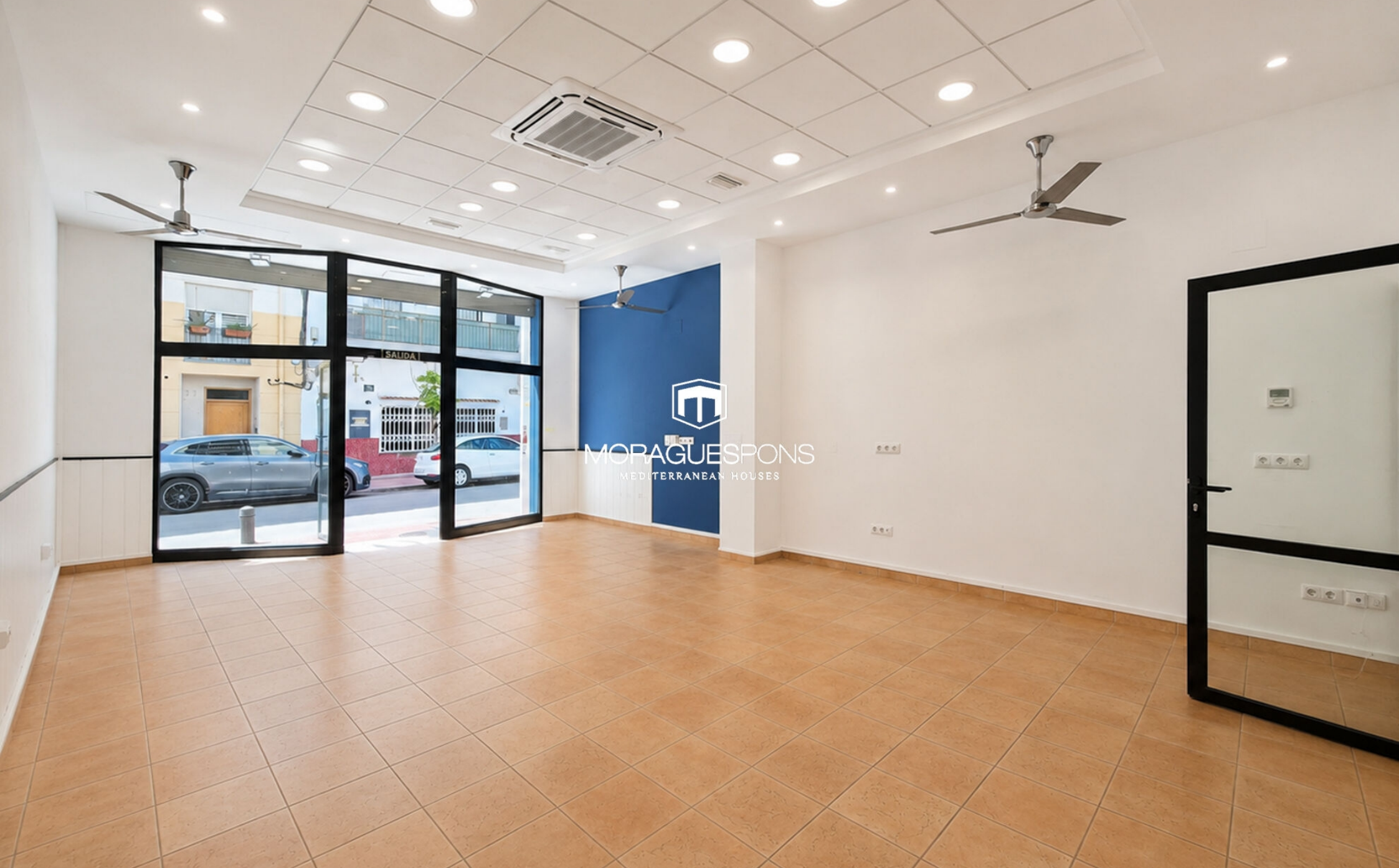
Commercial premises with excellent visibility in the Port of Jávea PORT, JÁVEA/XÀBIA - REF. LC-1688