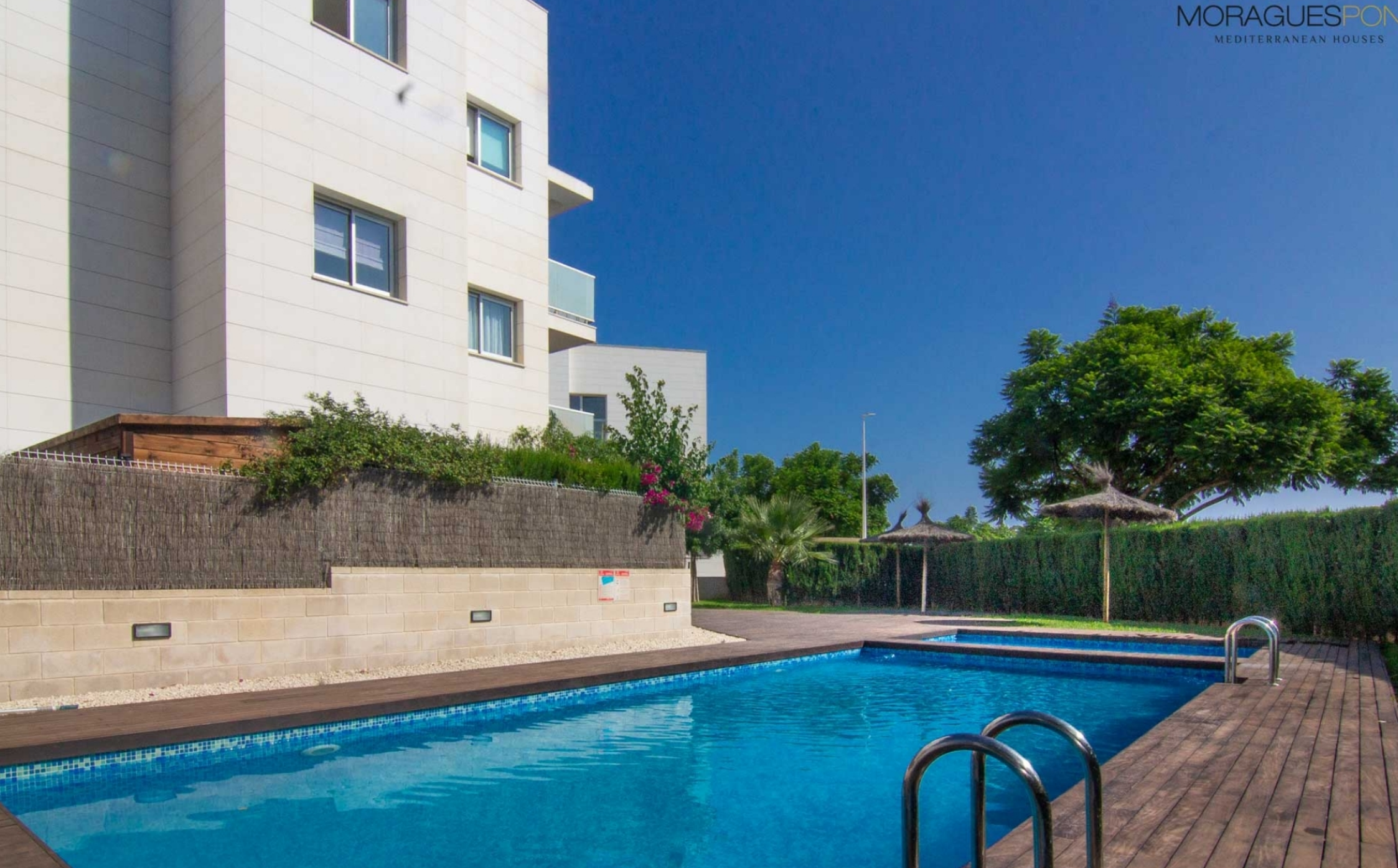
Ground floor apartment in the Arenal de Jávea for seasonal rental from September '25 to June '26. MONTAÑAR - EL ARENAL, JÁVEA/XÀBIA - REF. A-694