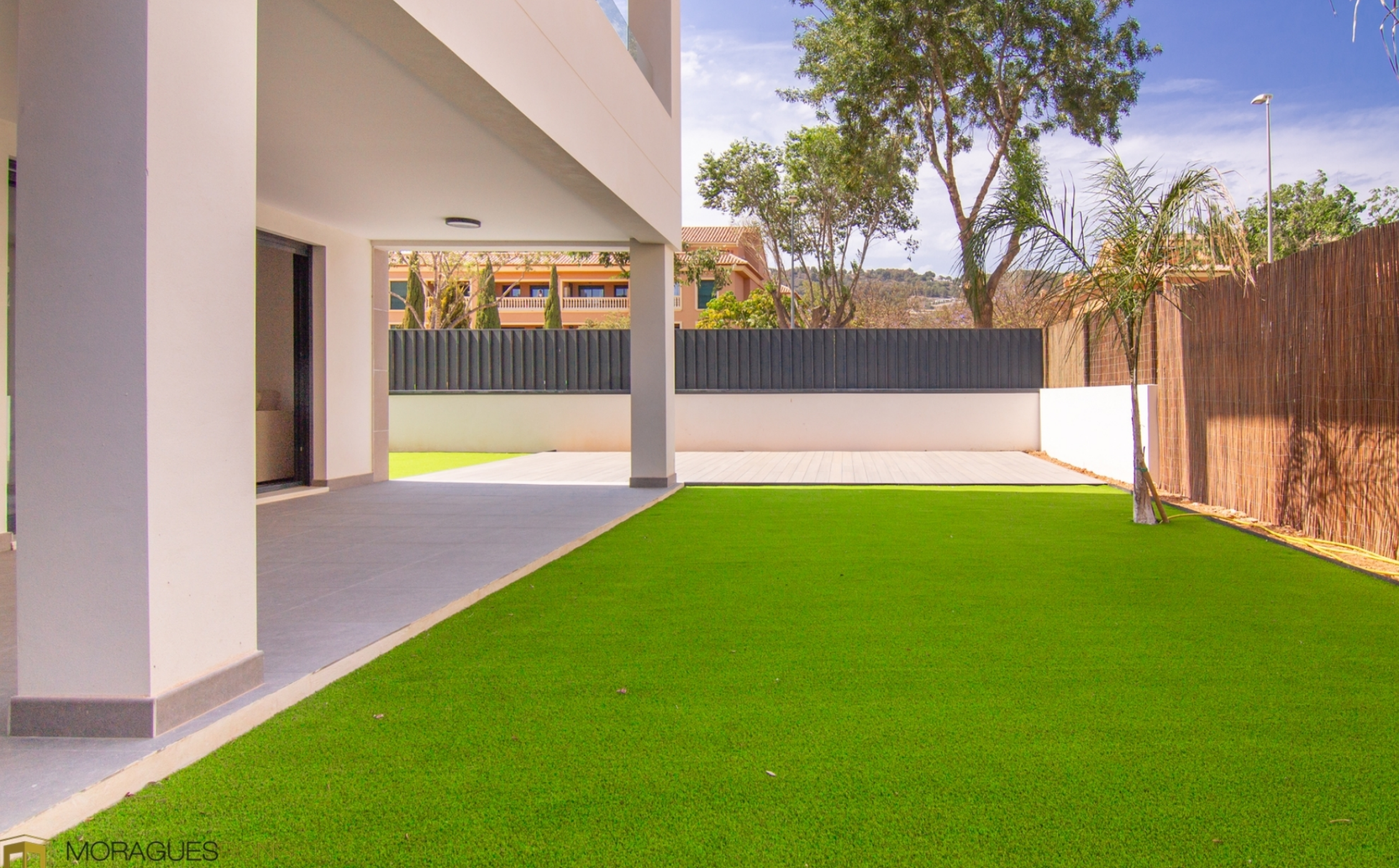
Ground floor apartment in the port of Jávea - Long term rental PORT, JÁVEA/XÀBIA - REF. A-690