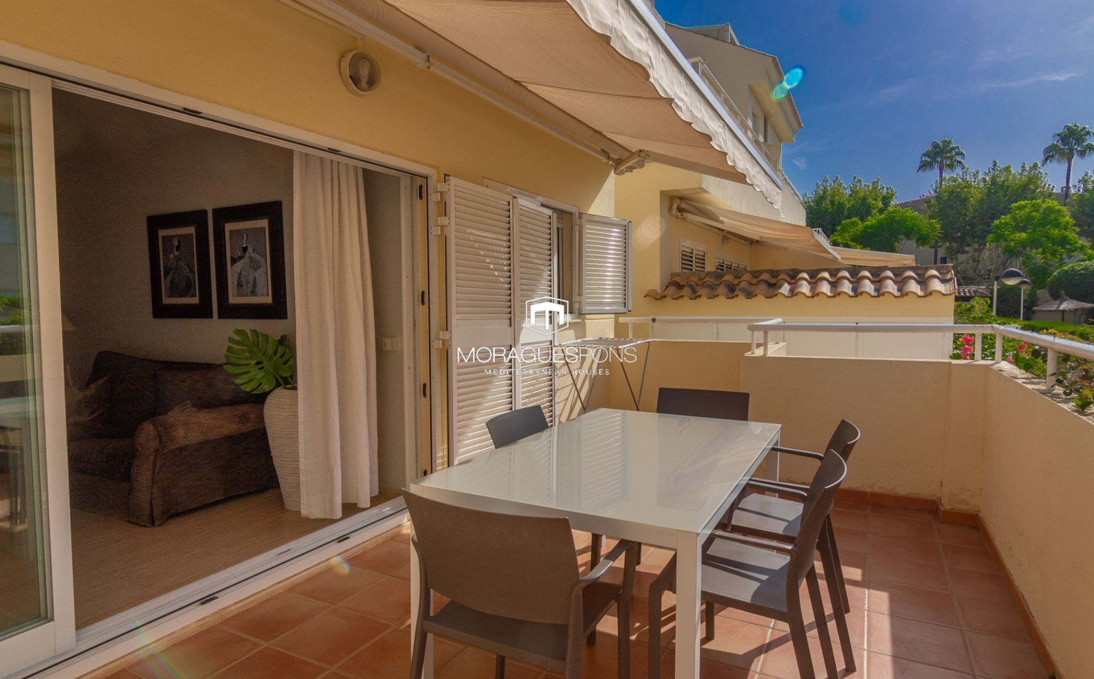
Ground floor apartment on Calle Génova – Seasonal rental from September to June MONTAÑAR - EL ARENAL, JÁVEA/XÀBIA - REF. A-1490