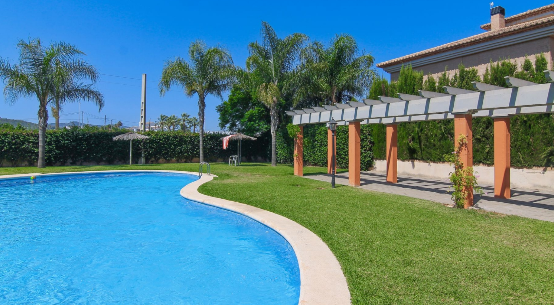
Ground floor next to the beach of the first mountain in Jávea MONTAÑAR - EL ARENAL, JÁVEA/XÀBIA - REF. A-670