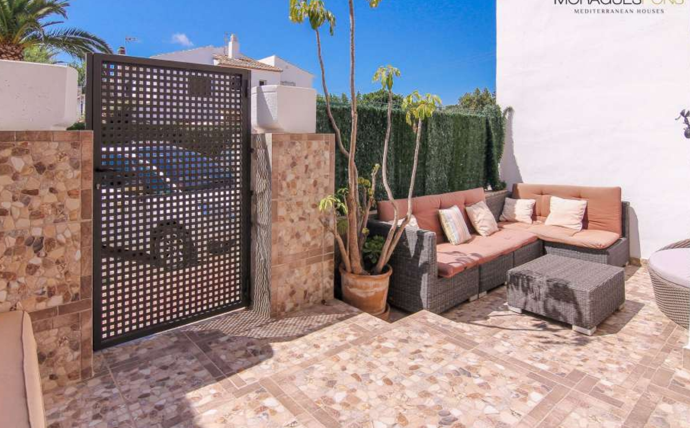
Long term rental in the port of Jávea PORT, JÁVEA/XÀBIA - REF. A-680