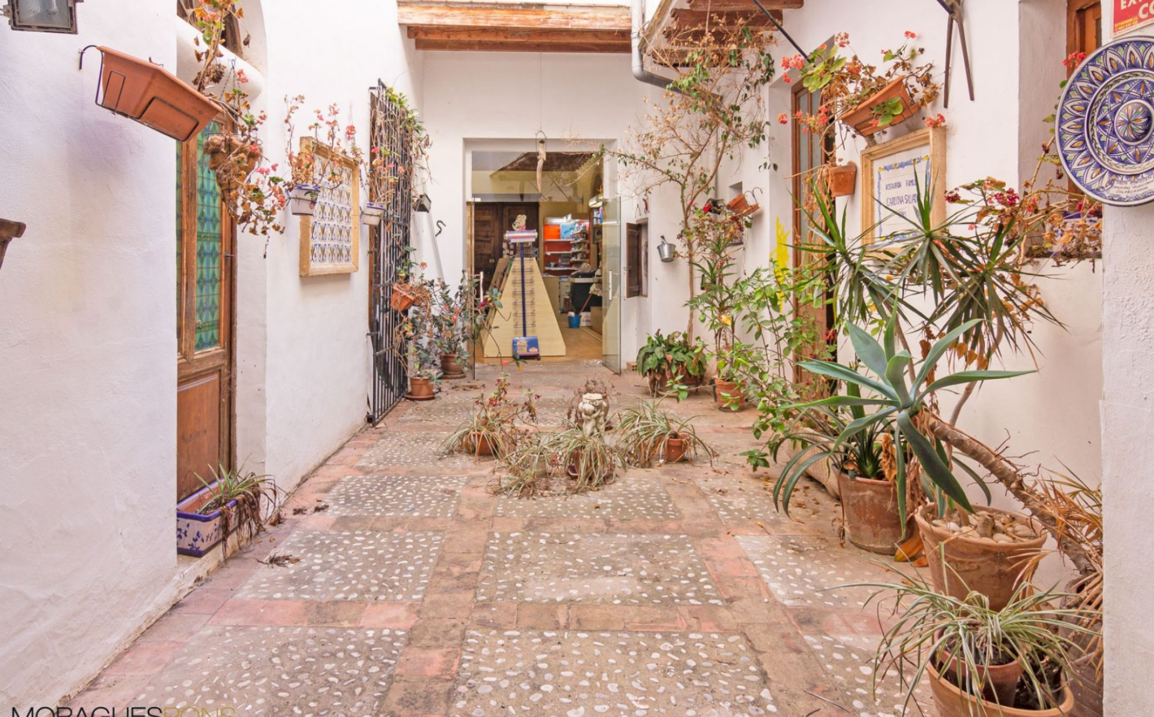
Magnificent townhouse for rent as business premises OLD TOWN CENTER, JÁVEA/XÀBIA - REF. LC-127