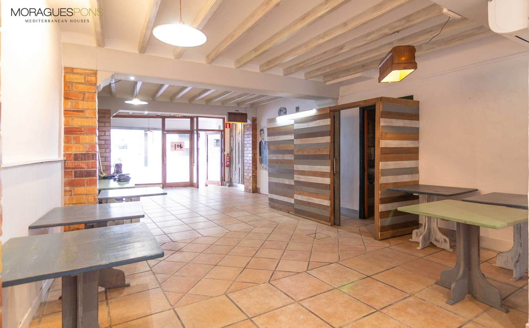
Marvellous local premises for rent in the town of Javea, close to the Post JÁVEA/XÀBIA - REF. LC-609