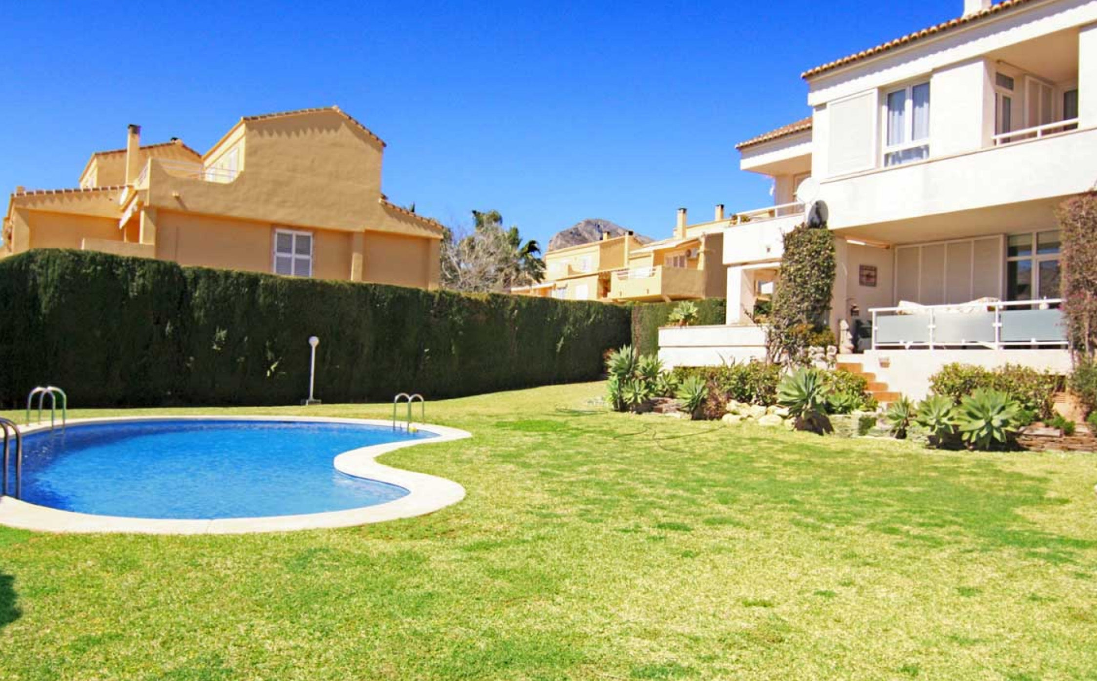
Town House for rent in the port of Javea PORT, JÁVEA/XÀBIA - REF. A-654