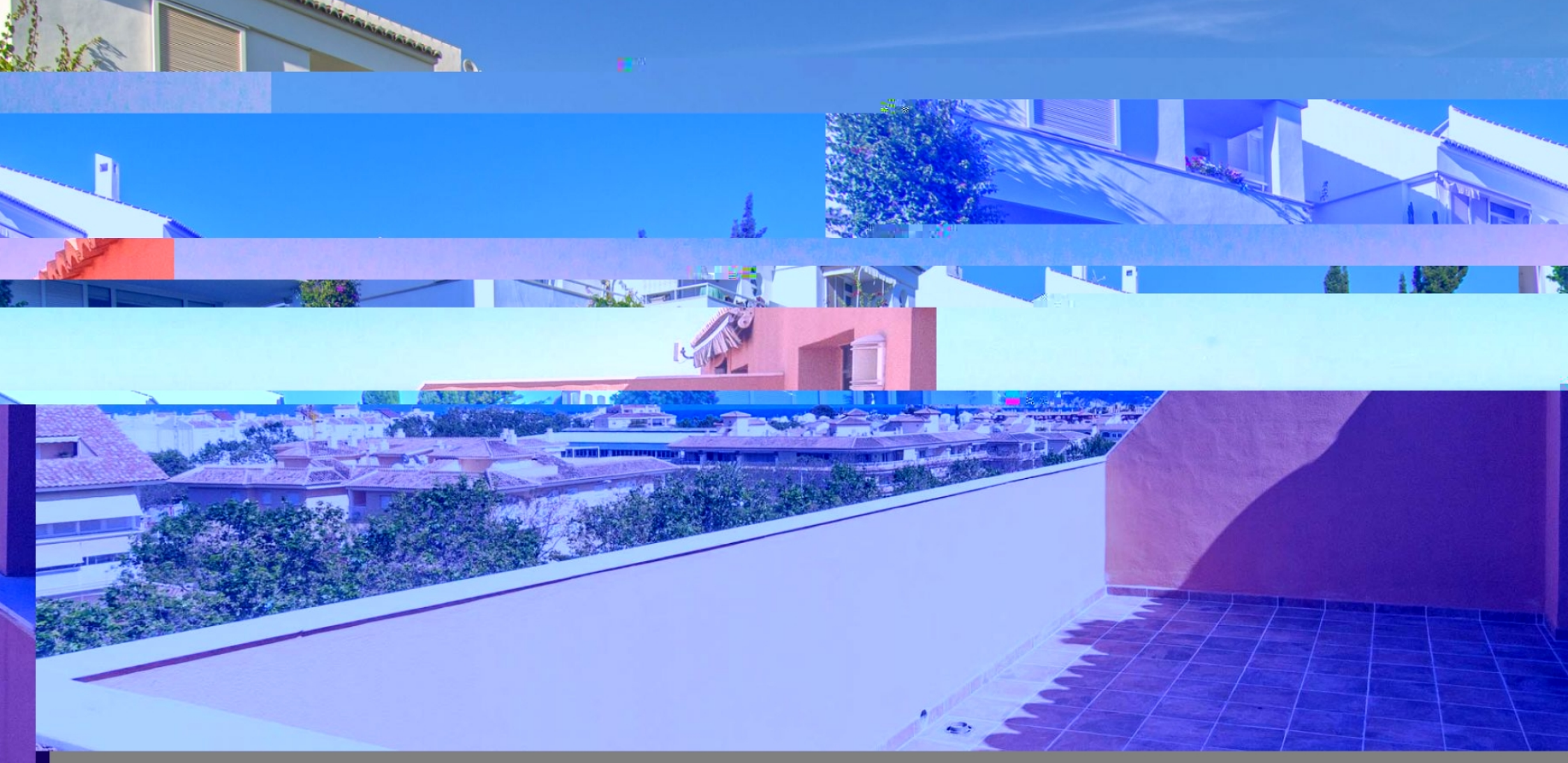
Townhouse for rent in Jávea Port PORT, JÁVEA/XÀBIA - REF. V-613