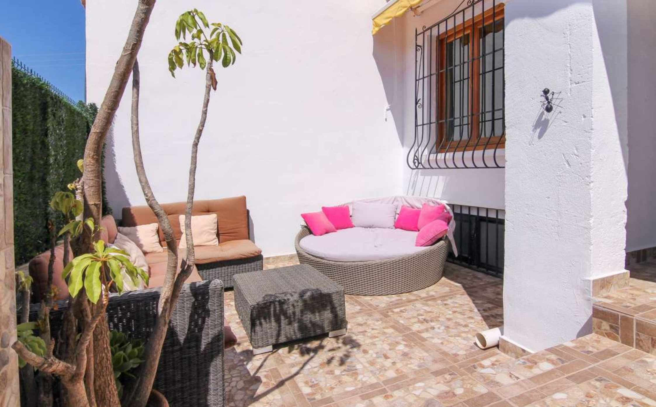
White stone walls Mediterranean this beautiful townhouse in Jávea MONTAÑAR - EL ARENAL, JÁVEA/XÀBIA - REF. V-631