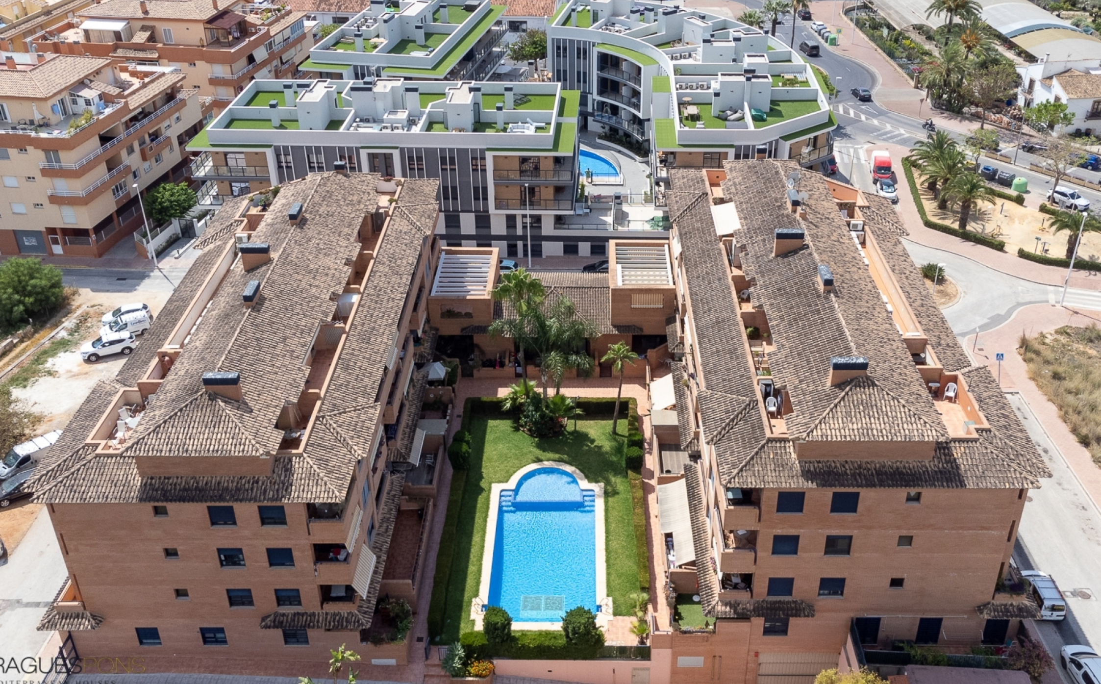
Ático con terraza y vistas al mar en Jávea CENTRO CIUDAD, JÁVEA/XÀBIA - REF. A-338