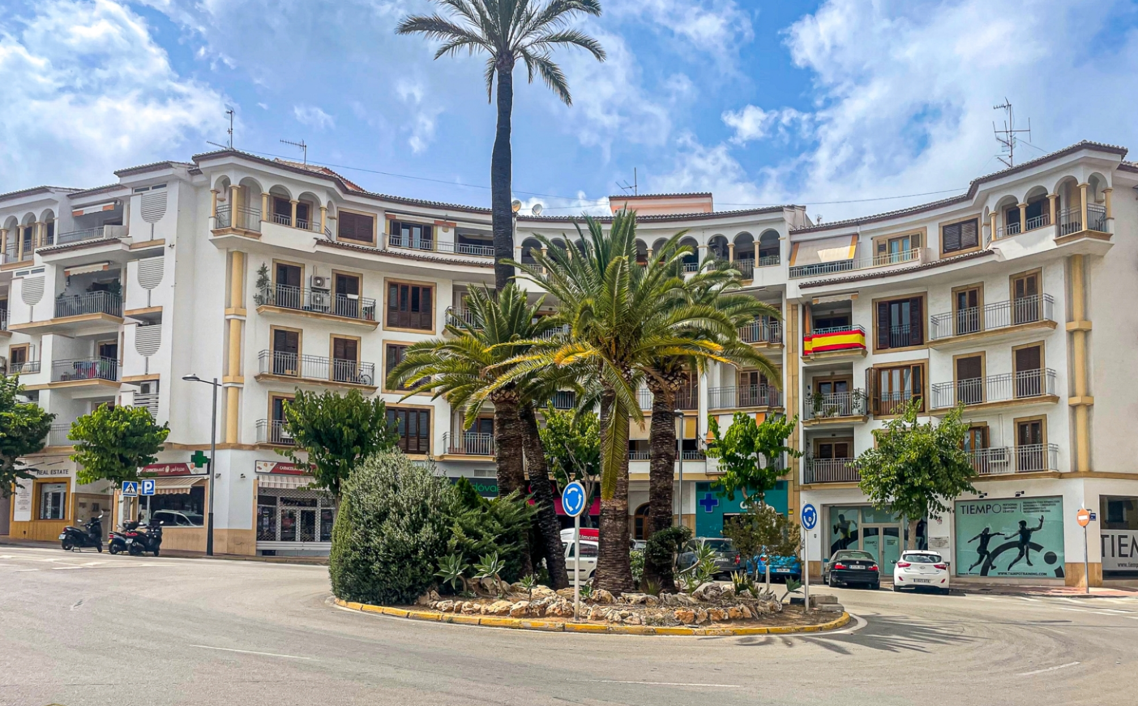
Commercial premises for sale next to Jávea town hall OLD TOWN CENTER, JÁVEA/XÀBIA - REF. LC-610